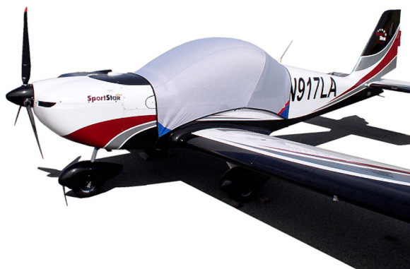
Evektor Sportstar Light Weight Travel-Cover