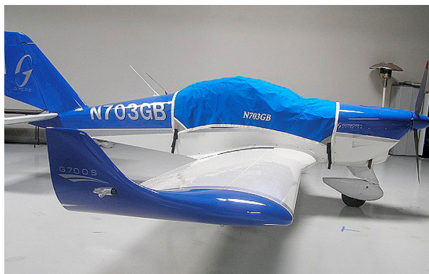
Gobosh Canopy Cover

This cover type is made from Silver Acrylic Sunbrella canvas and is 100% lined with a soft and smooth microfiber. Bruce's Custom Covers developed this material combination especially for aircraft protection. The outer material is medium weight and treated for water resistance, UV resistance and anti-static buildup. The inner lining is a very soft and smooth microfiber to prevent scratching. The material is very reflective, and tests show that the cabin interior temperature can be reduced to near-ambient temperature on the hottest of days. It is water, ice and snow repellent, yet breathable to allow moisture to escape from between the cover and the aircraft surface.