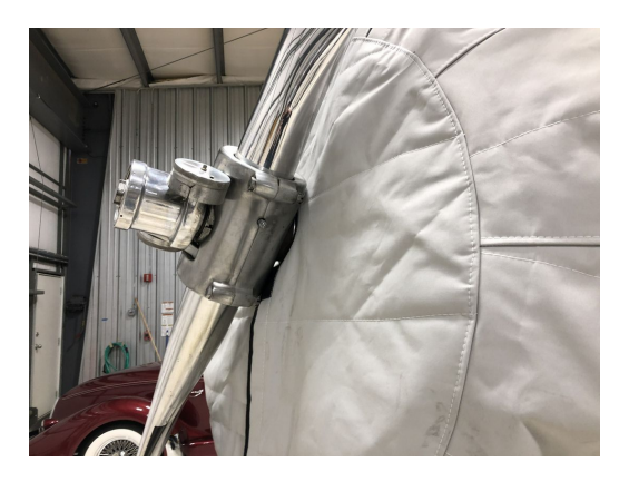
Stinson Reliant SR-10 Insulated Engine Cover