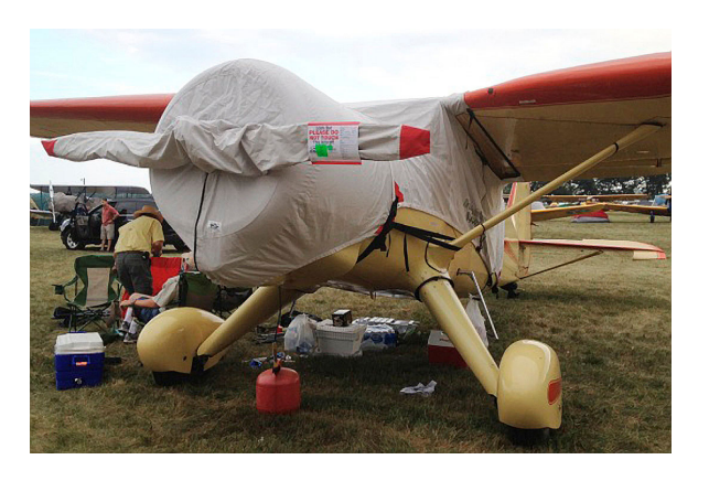
Stinson Reliant Over-the-top Canopy, Engine, and Propeller Cover