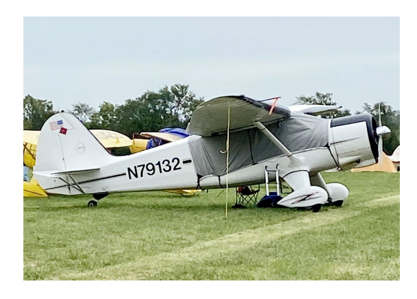
Consolidated Vultee V-77 Travel Cover