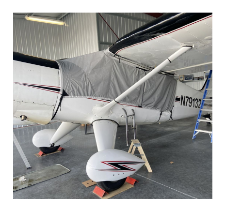
Consolidated Vultee V-77 Travel Cover