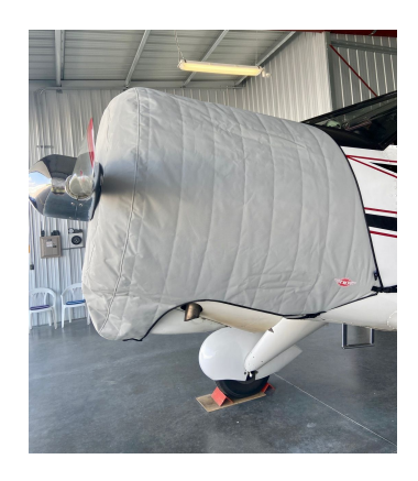
Stinson Reliant V-77, SR, AT-19 Insulated Engine Cover