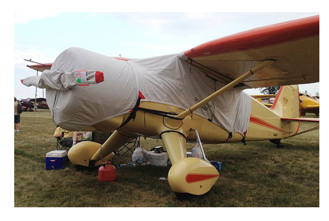
Stinson Reliant Over-the-top Canopy, Engine, and Propeller Cover