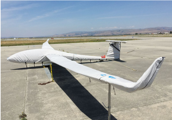
Schempp-Hirth Discus 2B Full Cover Set

WINTER USE MATERIAL - Made with Solution-Dyed Polyester fabric, this option is intended for seasonal use to aid in deicing, rain mitigation, or for occasional travel. The material is lighter and more compact, but more susceptible to UV damage and may have a shorter useful life if used continuously outside than the all-year use material.