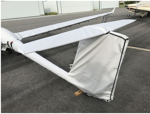
Schleicher ASW-27b Empennage & Wing Covers