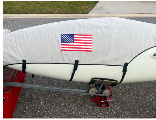
Schleicher ASW-20 Canopy/Nose Cover, ASW-20/20C