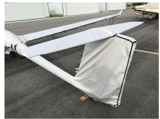
Sailplane Full Cover Set Graphic Indicators (Discus 2B, 3D model)