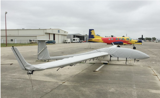
DG-505 Canopy/Nose, Wing, Empennage & Horiz. Stab. Covers