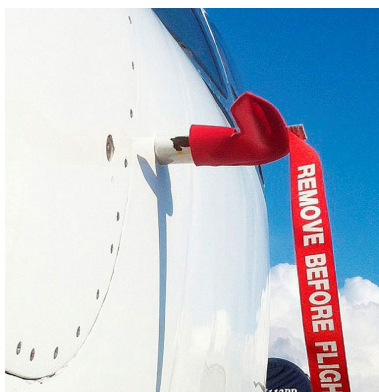
Westwind 1125 Astra Pitot Cover, Heat Resistant Type