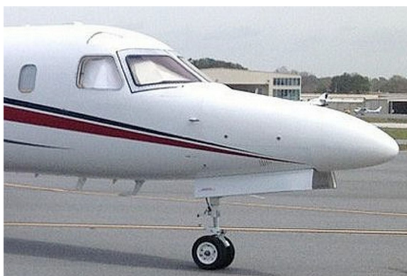
IAI Astra Cockpit Heatshields

Windshield Heatshields are interior sunshades for an aircraft's front windshield. The product is a unique composite of closed-cell foam with a silver mylar finish. The semi-rigid design is stiff enough to stand along the inside of the windshield using sun visors or window framing. It folds up flat and easily stores in the included storage sleeve. Some designs may require velcro and suction cups. Our Heatshields are offered white side out since aircraft manufacturers have issued advisories against reflective window inserts due to potential heat damage. A Heatshield is an excellent short-term remedy for cockpit overheating, but an external fabric cover is more effective for long-term protection.