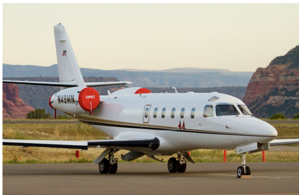
Israel Aircraft Astra Engine Covers

The Israel Aircraft Industries Astra (C-38) Bikini Style Engine Covers are a single-piece design using a soft and smooth stretchy fabric. The cover stretches tightly over both the intake and exhaust, installing quickly and easily. These covers are designed to be used as hangar dust covers and have a useful life of approximately one year.