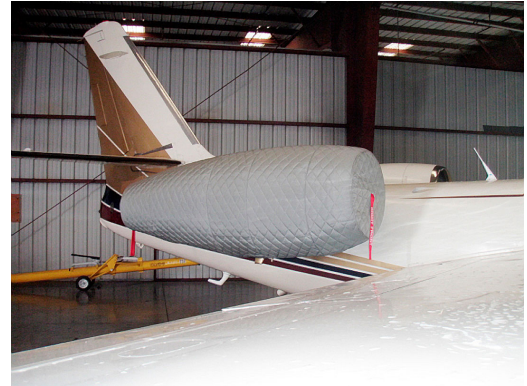
IAI Westwind Insulated Engine Nacelle Cover