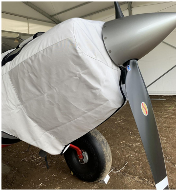
Cub Crafters CC-19 Engine Cover