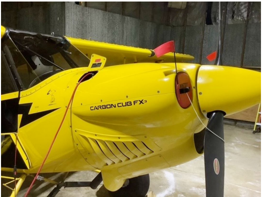
Cub Crafters CCX-2000 Engine Plugs