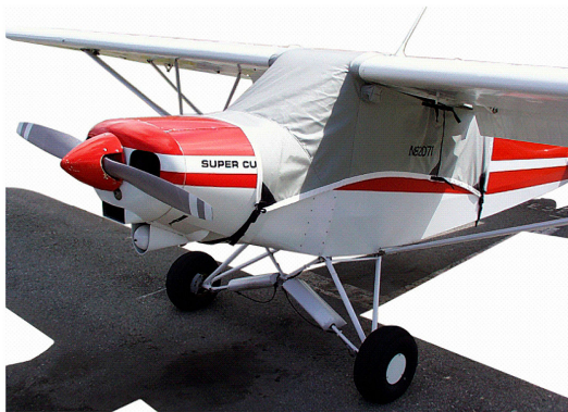
Piper PA-18 Super Cub Canopy Cover