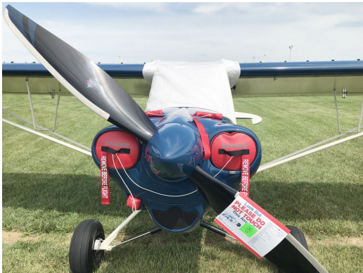
Cubcrafters CC-18 Engine Inlet Plugs

Engine Inlet Plugs are custom fit for your Lewaero Ascender intakes, made with heavy-duty vinyl material, and stuffed with a single block of sculpted urethane foam. Each plug has a zipper that allows the foam to be removed and dried if necessary. Engine plugs have warning flags that are visible from the cockpit or 'remove before flight' streamers sewn onto the face of the plugs. Most plugs are imprinted with the aircraft registration number in black for an extra charge. Storage bag NOT included. Engine plugs may be inserted after flight when the engine is still warm. Engine Inlet Plugs are commonly referred to as Cowl Plugs, Intake Plugs, Cowl Blocks, Engine Blocks, and Engine Bungs.