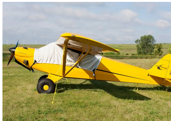
Cub Crafters Canopy Cover