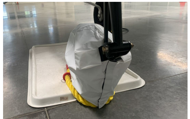
Cub Crafters Tire Covers, tricycle gear, test fit covers