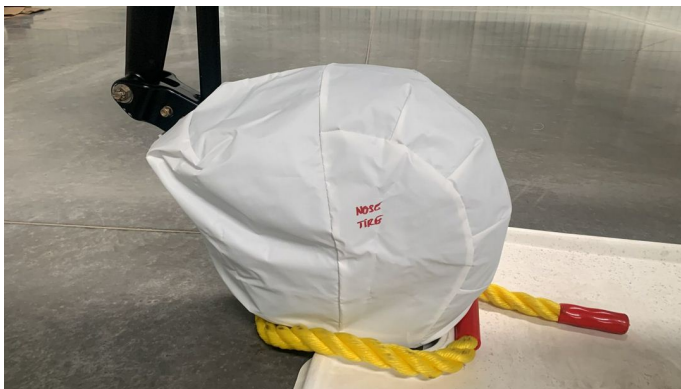
Cub Crafters Tire Covers, tricycle gear, test fit covers

ALL-YEAR USE MATERIAL - Made with Silver Acrylic Sunbrella canvas, the all-year use material is the best option for sun protection and cover longevity. This heavier more durable material is intended for all weather conditions, such as rain and snow or lots of sun.