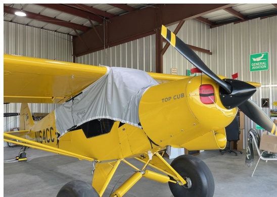
Cub Crafters CC-18 Light Weight Travel Canopy Cover, Engine Plugs