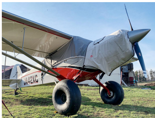
Cub Crafters CC19 X-Cub Engine Cover, Travel Weight Canopy Cover

Travel Covers are made with Silver Solution-Dyed Polyester fabric and only lined over the windshield to save weight. The material is lightweight and more compact for easy stowage in the aircraft. The polyester material is water resistant, but only intended for occasional use outside. We also have an ultra lightweight material available for fitted hangar dust covers. For daily outdoor use, the non-travel Sunbrella Cover is the best choice.