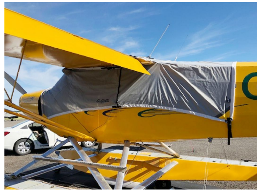
Sportsman 2+2 Wag Aero Light Weight Over the Top Travel Canopy Cover