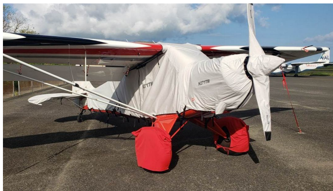
Aviat Husky Extended Canopy Cover, Engine, Prop, Empennage & Tire Covers

ALL-YEAR USE MATERIAL - Made with Silver Acrylic Sunbrella canvas, the all-year use material is the best option for sun protection and cover longevity. This heavier more durable material is intended for all weather conditions, such as rain and snow or lots of sun.