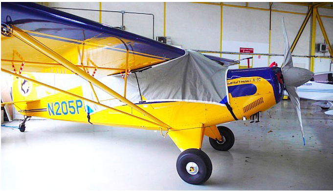
Aviat Husky Canopy & Prop Covers

This cover type is made from Silver Acrylic Sunbrella canvas and is 100% lined with a soft and smooth microfiber. Bruce's Custom Covers developed this material combination especially for aircraft protection. The outer material is medium weight and treated for water resistance, UV resistance and anti-static buildup. The inner lining is a very soft and smooth microfiber to prevent scratching. The material is very reflective, and tests show that the cabin interior temperature can be reduced to near-ambient temperature on the hottest of days. It is water, ice and snow repellent, yet breathable to allow moisture to escape from between the cover and the aircraft surface.