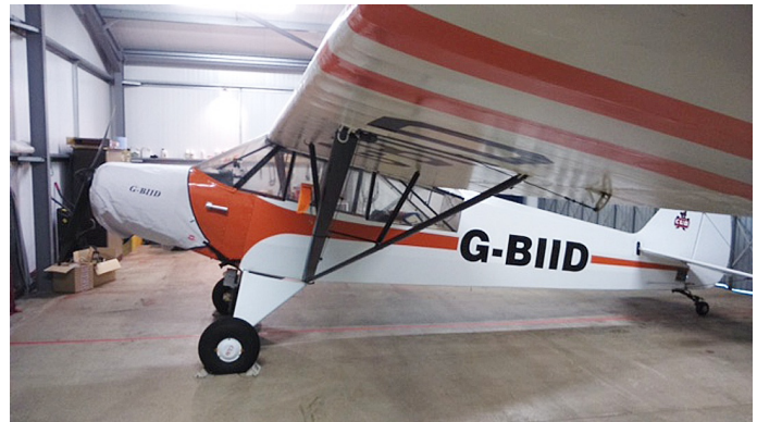
Piper Super Cub Engine Cover