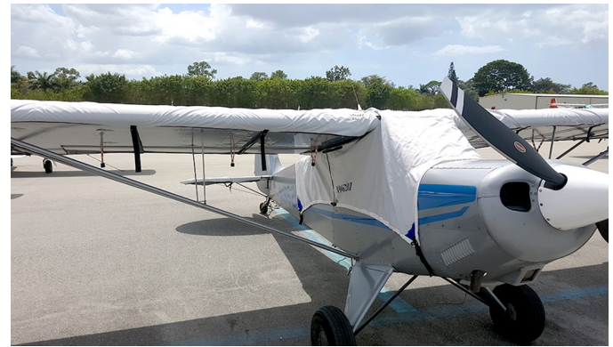
Aviat Husky Extended Canopy Cover, Engine, Prop, Empennage & Tire Covers