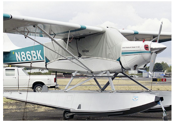
Aviat Husky Canopy Cover and Inlet Plugs