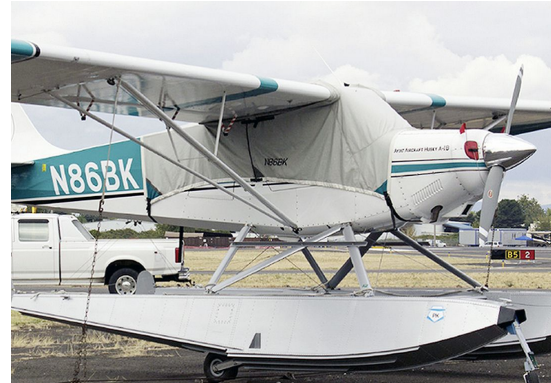
Aviat Husky Canopy Cover and Inlet Plugs