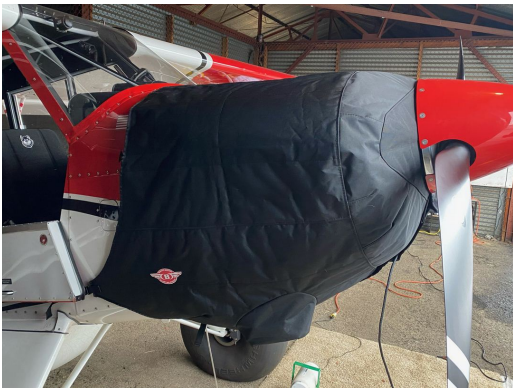
Aviat Husky insulated engine cover

This cover type is made from Silver Acrylic Sunbrella canvas and is 100% lined with a soft and smooth microfiber. Bruce's Custom Covers developed this material combination especially for aircraft protection. The outer material is medium weight and treated for water resistance, UV resistance and anti-static buildup. The inner lining is a very soft and smooth microfiber to prevent scratching. The material is very reflective, and tests show that the cabin interior temperature can be reduced to near-ambient temperature on the hottest of days. It is water, ice and snow repellent, yet breathable to allow moisture to escape from between the cover and the aircraft surface.