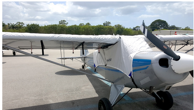
Aviat (Christen) Husky Canopy Cover (Over-The-Top Style)