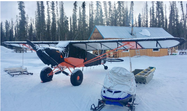
Aviat Husky Engine Plugs, Canopy, Wing & Empennage Covers Piper PA-18 Super Cub Canopy Cover (Over-The-Top Style)