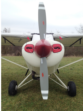
Aviat Husky Engine Plugs, Wing Covers

Engine Inlet Plugs are custom fit for your Normand Dube Aerocruiser intakes, made with heavy-duty vinyl material, and stuffed with a single block of sculpted urethane foam. Each plug has a zipper that allows the foam to be removed and dried if necessary. Engine plugs have warning flags that are visible from the cockpit or 'remove before flight' streamers sewn onto the face of the plugs. Most plugs are imprinted with the aircraft registration number in black for an extra charge. Storage bag NOT included. Engine plugs may be inserted after flight when the engine is still warm. Engine Inlet Plugs are commonly referred to as Cowl Plugs, Intake Plugs, Cowl Blocks, Engine Blocks, and Engine Bung.