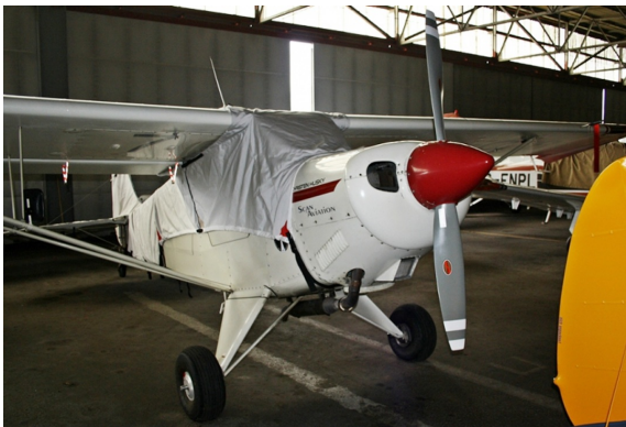
Aviat Husky Canopy Cover, Empennage Cover

WINTER USE MATERIAL - Made with Solution-Dyed Polyester fabric, this option is intended for seasonal use to aid in deicing, rain mitigation, or for occasional travel. The material is lighter and more compact, but more susceptible to UV damage and may have a shorter useful life if used continuously outside than the all-year use material.