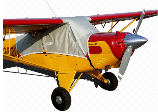
Aviat Husky Canopy Cover & Engine Plugs