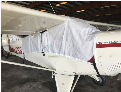
Aviat Husky Canopy Cover

This cover type is made from Silver Acrylic Sunbrella canvas and is 100% lined with a soft and smooth microfiber. Bruce's Custom Covers developed this material combination especially for aircraft protection. The outer material is medium weight and treated for water resistance, UV resistance and anti-static buildup. The inner lining is a very soft and smooth microfiber to prevent scratching. The material is very reflective, and tests show that the cabin interior temperature can be reduced to near-ambient temperature on the hottest of days. It is water, ice and snow repellent, yet breathable to allow moisture to escape from between the cover and the aircraft surface.