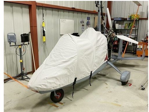
Magni Auto Gyro M16 Cockpit/Nose Cover