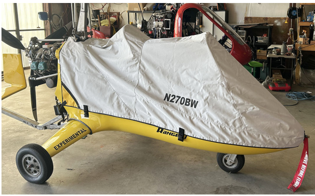
American Ranger AR-1 Gyrocopter Canopy/Nose Cover