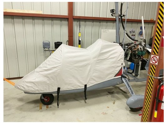
Magni Auto Gyro M16 Cockpit/Nose Cover