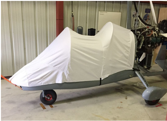
Magni M16 Autogyro Canopy/Nose Cover, test fit cover

Travel Covers are made with Silver Solution-Dyed Polyester fabric and fully lined over the entire cover. The material is lightweight and more compact for easy storage in the aircraft. The polyester material is water resistant, but only intended for occasional use outside. We also have an ultra lightweight material available for fitted hangar dust covers. For daily outdoor use, the non-travel Sunbrella Cover is the best choice.