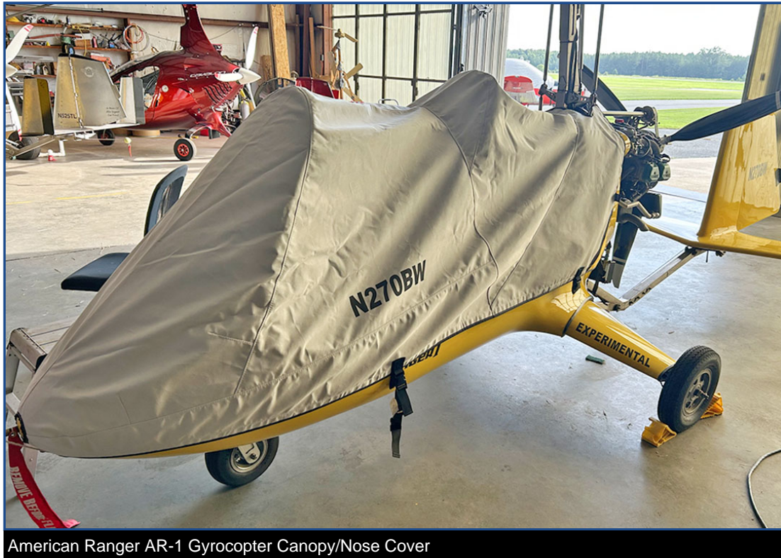
American Ranger AR-1 Gyrocopter Canopy/Nose Cover