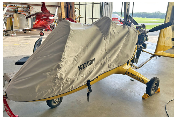
American Ranger AR-1 Gyrocopter Canopy/Nose Cover