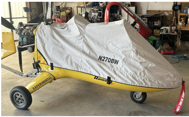
American Ranger AR-1 Gyrocopter Canopy/Nose Cover