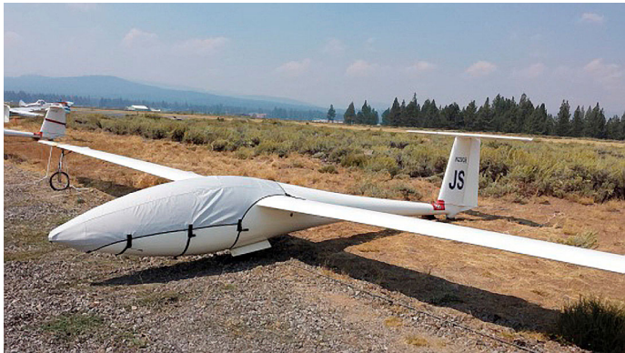
ASW-20C Canopy/Nose Cover