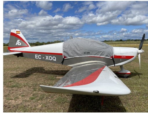
Direct Fly Alto Travel Cover, Light Weight Canopy Cover