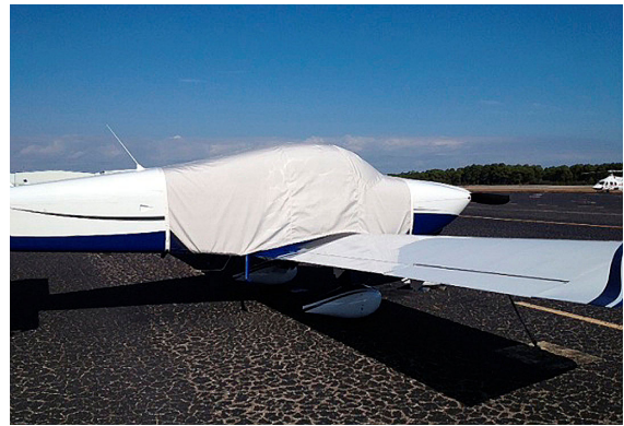
Van's RV-10 Extended Canopy Cover