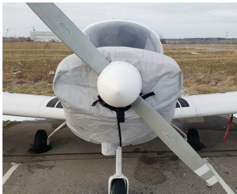
Alarus CH-2000 Insulated Engine Cover

This cover type is made from Silver Acrylic Sunbrella canvas and is 100% lined with a soft and smooth microfiber. Bruce's Custom Covers developed this material combination especially for aircraft protection. The outer material is medium weight and treated for water resistance, UV resistance and anti-static buildup. The inner lining is a very soft and smooth microfiber to prevent scratching. The material is very reflective, and tests show that the cabin interior temperature can be reduced to near-ambient temperature on the hottest of days. It is water, ice and snow repellent, yet breathable to allow moisture to escape from between the cover and the aircraft surface.