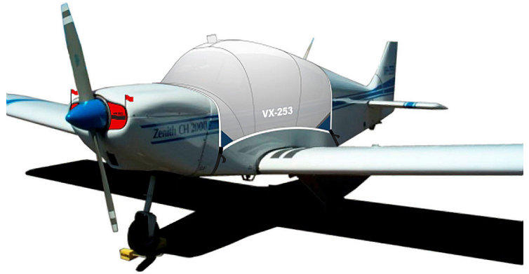
AMD Alarus CH2000 Std Canopy Cover & Engine Plugs (Illustration)