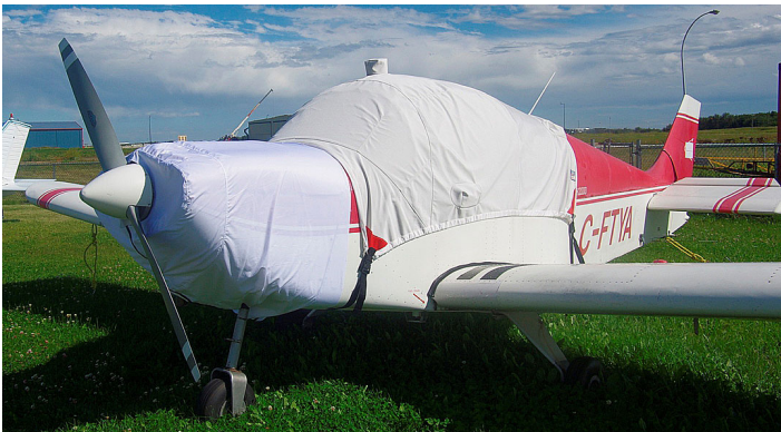
Alarus CH2000 Canopy Cover & Engine Cover (test fit)

This cover type is made from Silver Acrylic Sunbrella canvas and is 100% lined with a soft and smooth microfiber. Bruce's Custom Covers developed this material combination especially for aircraft protection. The outer material is medium weight and treated for water resistance, UV resistance and anti-static buildup. The inner lining is a very soft and smooth microfiber to prevent scratching. The material is very reflective, and tests show that the cabin interior temperature can be reduced to near-ambient temperature on the hottest of days. It is water, ice and snow repellent, yet breathable to allow moisture to escape from between the cover and the aircraft surface.