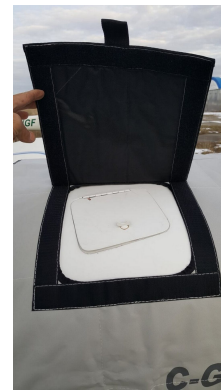
Alarus CH-2000 Insulated Engine Cover