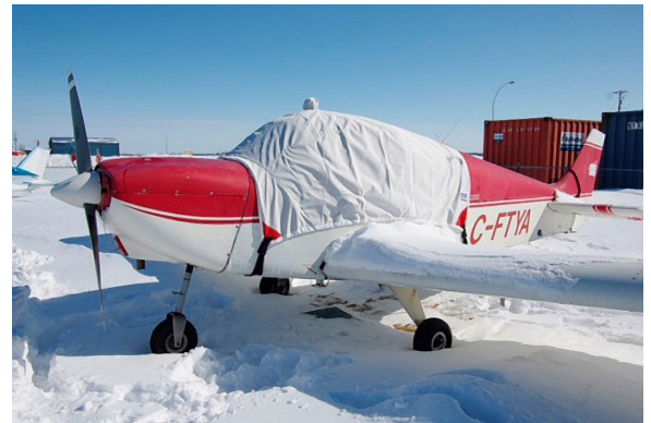
Alarus CH2000 Canopy Cover & Engine Plugs