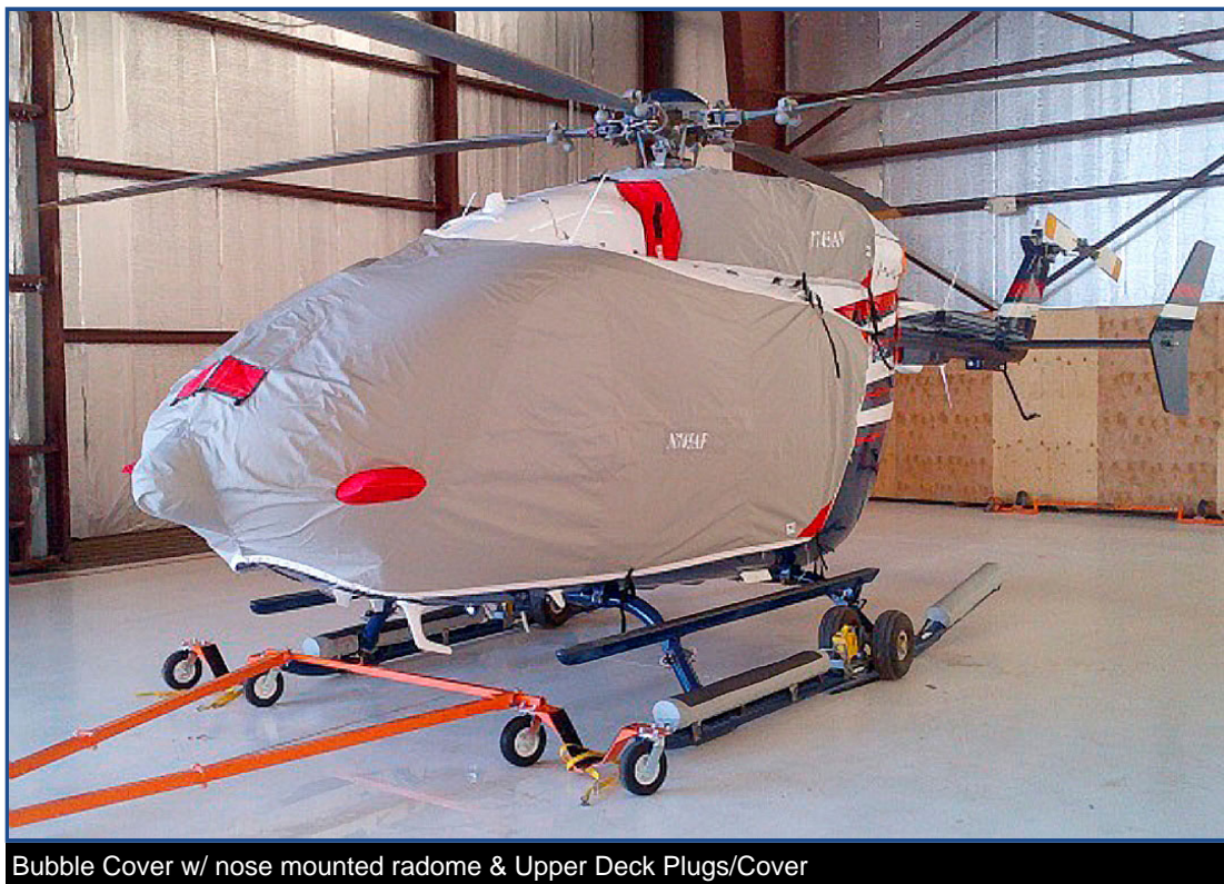
Bubble Cover w/ nose mounted radome &amp; Upper Deck Plugs/Cover