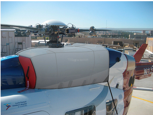
Upper Deck Plugs/Cover, extended to cover aft intake vents

The Engine Inlet Plugs are custom fit for your Airbus Helicopter UH-72A intakes, made with heavy-duty vinyl material, and stuffed with a single block of sculpted urethane foam. Each plug has a zipper that allows the foam to be removed and dried if necessary. Engine plugs have 'Remove Before Flight' streamers sewn onto the face of the plugs. Most plugs are imprinted with the aircraft registration number in black for an extra charge. Storage bag NOT included. Engine plugs may be inserted after flight when the engine is still warm. Engine Inlet Plugs are commonly referred to as Cowl Plugs, Intake Plugs, Cowl Blocks, Engine Blocks, and Engine Bunges.