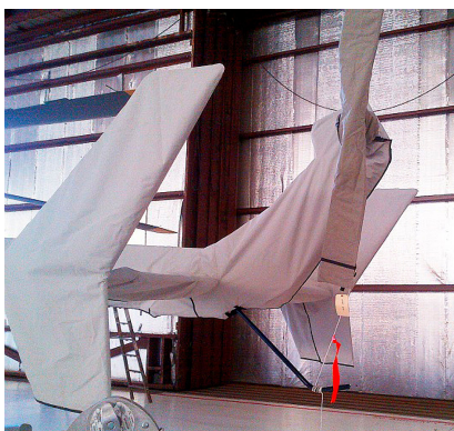
Tail Rotor Cover & Tailboom, Vertical Pylon & Stabilizers Cover

The Tailboom Cover details vary by model, but generally the helicopter tail boom cover encloses the tail boom from the "bottleneck" to the aft end. They usually also cover the horizontal stabilizers, and are custom made to allow for antennae, lights, and other protrusions. They attach with straps underneath the tail boom. Covers for the vertical and horizontal stabilizers are also available separately. Specific information for each model is available on request.