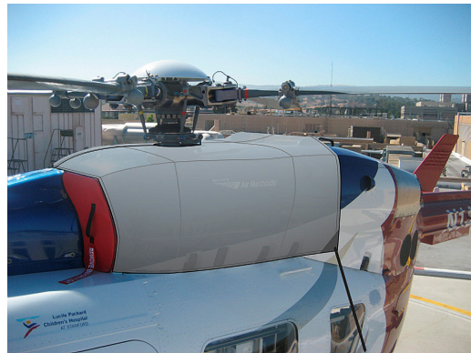
Upper Deck Plugs/Cover, extended to cover aft intake vents