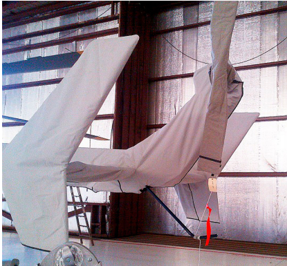
Tail Rotor Cover & Tailboom, Vertical Pylon & Stabilizers Cover

The Tailboom Cover details vary by model, but generally the helicopter tail boom cover encloses the tail boom from the "bottleneck" to the aft end. They usually also cover the horizontal stabilizers, and are custom made to allow for antennae, lights, and other protrusions. They attach with straps underneath the tail boom. Covers for the vertical and horizontal stabilizers are also available separately. Specific information for each model is available on request.