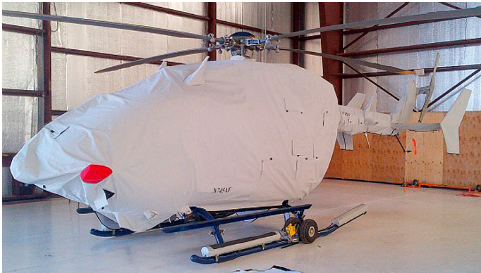
Main Body (also covers bottom), Tailboom, Vertical Pylon, Stabilizers and Tail Rotor Covers

Covers developed this material combination especially for aircraft protection. The outer material is medium weight and treated for water resistance, UV resistance and anti-static buildup. The inner lining is a very soft and smooth microfiber to prevent scratching. The material is very reflective, and tests show that the cabin interior temperature can be reduced to near-ambient temperature on the hottest of days. It is water, ice and snow repellent, yet breathable to allow moisture to escape from between the cover and the aircraft surface.