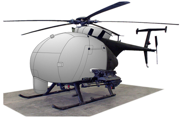
Hughes 500D Bubble Cover with Wire Strike detail and Blade Tie-downs MH-6J Bubble, Flir & Doghouse Covers (illustration)