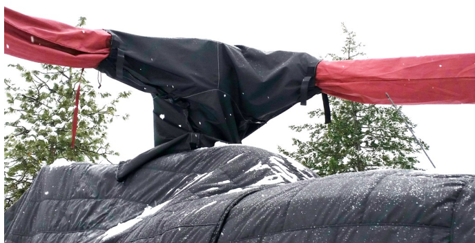
Main Rotor Hub Cover with swash plate extension.

WINTER USE MATERIAL - Made with Solution-Dyed Polyester fabric, this option is intended for seasonal use to aid in deicing, rain mitigation, or for occasional travel. The material is lighter and more compact, but more susceptible to UV damage and may have a shorter useful life if used continuously outside than the all-year use material.