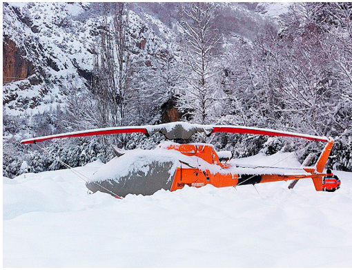
AS350 Bubble Cover, Insulated Main & Tail Rotor Covers, Blade Covers with tie-down detail