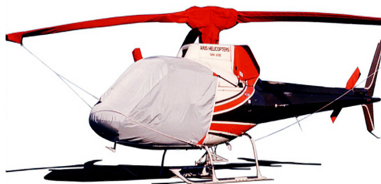
Bubble Cover, Intake/Exhaust, Rotor Mast, Tail Rotor & Main Body Covers