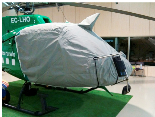
AS350 Bubble Cover with Wire Strike and Cargo Mirror

Travel Covers are made with Silver Solution-Dyed Polyester fabric and fully lined over the entire cover. The material is lightweight and more compact for easy stowage in the aircraft. The polyester material is water resistant, but only intended for occasional use outside. We also have an ultra lightweight material available for fitted hangar dust covers. For daily outdoor use, the non-travel Sunbrella Cover is the best choice.