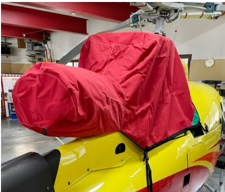
Airbus Helicopter H-125 Exhaust Cover (As350b-3) Airbus Helicopter H-125 & AS350 Intake/Exhaust Cover (newer design)