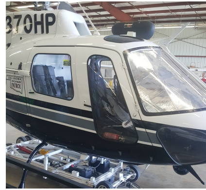
Aerospatiale AS350 Astar, Ecureuil, Esquilo, Fennec Windshield Heatshields