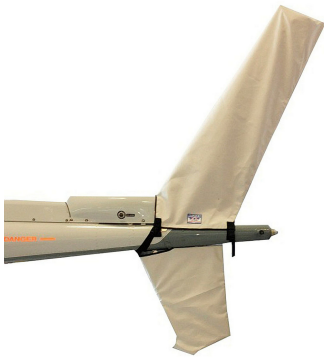
AS350B3 Vertical Stabilizers cover

The Tailboom Cover details vary by model, but generally the helicopter tail boom cover encloses the tail boom from the "bottleneck" to the aft end. They usually also cover the horizontal stabilizers, and are custom made to allow for antennae, lights, and other protrusions. They attach with straps underneath the tail boom. Covers for the vertical and horizontal stabilizers are also available separately. Specific information for each model is available on request.