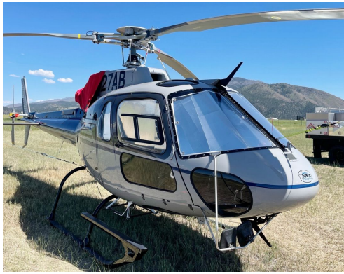
Eurocopter AS350-B3 Cabin HeatShields, Intake/Exhaust Cover