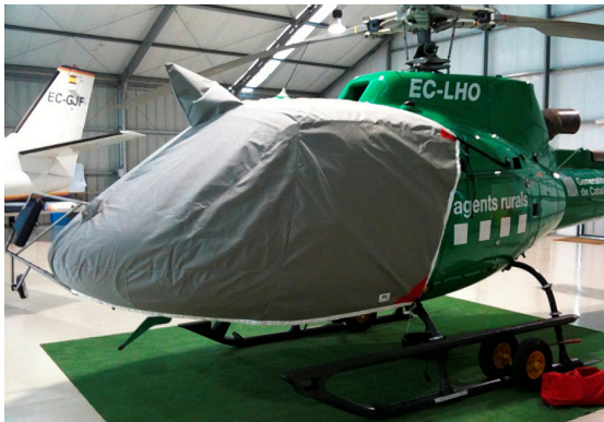
AS350 Bubble Cover with Wire Strike and Cargo Mirror

water resistance, UV resistance and anti-static buildup. The inner lining is a very soft and smooth microfiber to prevent scratching. The material is very reflective, and tests show that the cabin interior temperature can be reduced to near-ambient temperature on the hottest of days. It is water, ice and snow repellent, yet breathable to allow moisture to escape from between the cover and the aircraft surface.