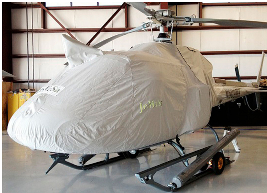
Eurocopter AS350 Main Body Cover