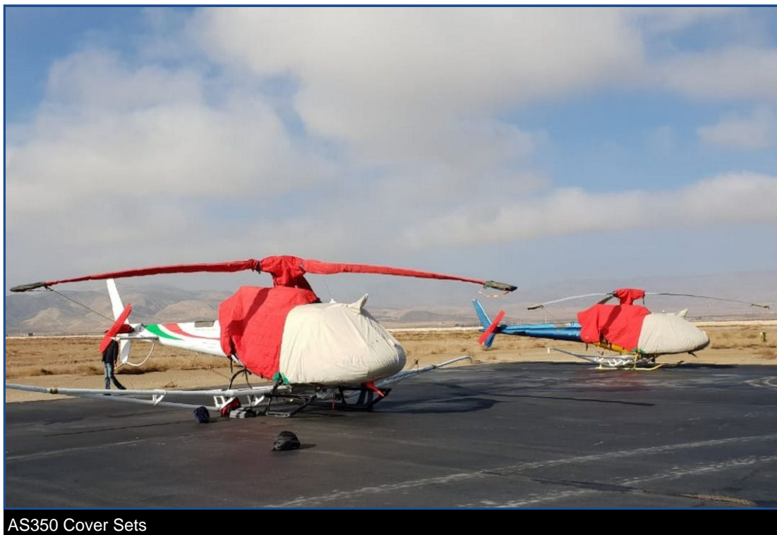
AS350 Cover Sets