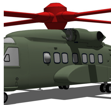
Sikorsky S-92 Main Rotor Hub Cover