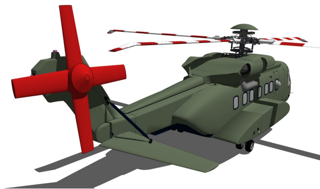
Sikorsky S-92 Tail Rotor Blade and Hub Covers

WINTER USE MATERIAL - Made with Solution-Dyed Polyester fabric, this option is intended for seasonal use to aid in deicing, rain mitigation, or for occasional travel. The material is lighter and more compact, but more susceptible to UV damage and may have a shorter useful life if used continuously outside than the all-year use material.