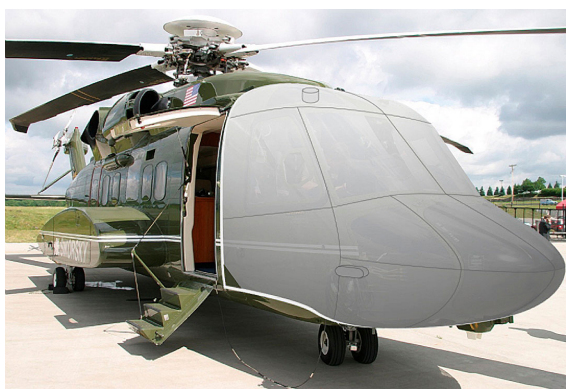
Sikorsky S-92 Windshield/Nose Cover (illustration)

This cover type is made from Silver Acrylic Sunbrella canvas and is 100% lined with a soft and smooth microfiber. Bruce's Custom Covers developed this material combination especially for aircraft protection. The outer material is medium weight and treated for water resistance, UV resistance and anti-static buildup. The inner lining is a very soft and smooth microfiber to prevent scratching. The material is very reflective, and tests show that the cabin interior temperature can be reduced to near-ambient temperature on the hottest of days. It is water, ice and snow repellent, yet breathable to allow moisture to escape from between the cover and the aircraft surface.