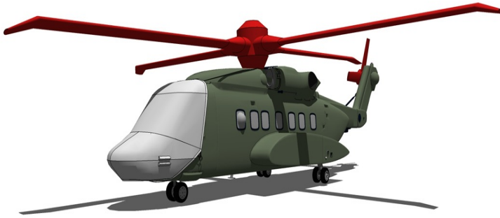
Sikorsky S-92 Windshield/Nose, Blade, Rotor Hub & Tail Rotor Covers

WINTER USE MATERIAL - Made with Solution-Dyed Polyester fabric, this option is intended for seasonal use to aid in deicing, rain mitigation, or for occasional travel. The material is lighter and more compact, but more susceptible to UV damage and may have a shorter useful life if used continuously outside than the all-year use material.