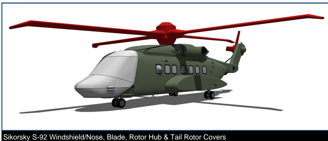
Sikorsky S-92 Windshield/Nose, Blade, Rotor Hub & Tail Rotor Covers