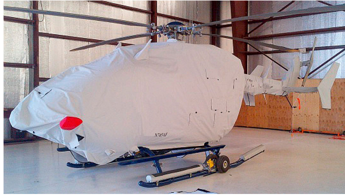
Main Body (also covers bottom), Tailboom, Vertical Pylon, Stabilizers and Tail Rotor Covers