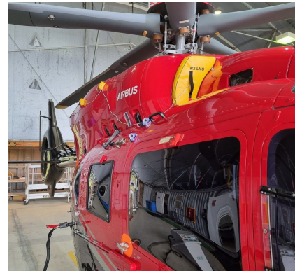
Airbus Helicopter H145D3 Intake Plugs