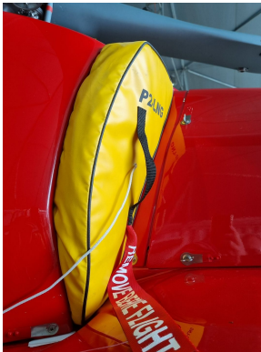
Airbus Helicopter H145D3 Intake Plugs

The Engine Inlet Plugs are custom fit for your Airbus Helicopter EC-145, UH-145, BK-117 D-2 intakes, made with heavy-duty vinyl material, and stuffed with a single block of sculpted urethane foam. Each plug has a zipper that allows the foam to be removed and dried if necessary. Engine plugs have 'Remove Before Flight' streamers sewn onto the face of the plugs. Most plugs are imprinted with the aircraft registration number in black for an extra charge. Storage bag NOT included. Engine plugs may be inserted after flight when the engine is still warm. Engine Inlet Plugs are commonly referred to as Cowl Plugs, Intake Plugs, Cowl Blocks, Engine Blocks, and Engine Bung.