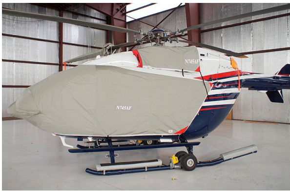
Bubble Cover w/ nose mounted radome, Upper Deck Plugs/Cover