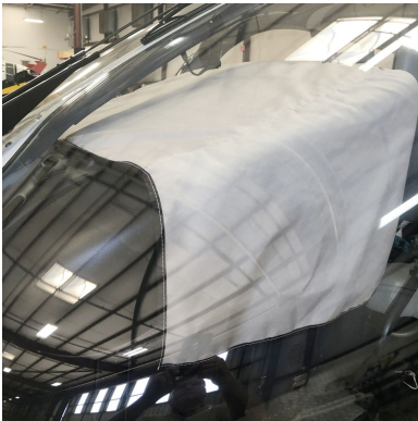
Eurocopter EC-135 Instrument Panel Heatshield Cover