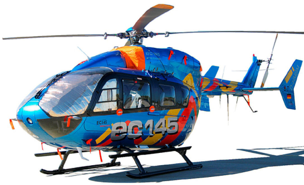
EC-145 Cabin Heatshield Set

Heatshields are interior sunshades for an aircraft's windows or canopy glass. The product is a unique composite of closed-cell foam with a silver mylar finish. The semi-rigid design is stiff enough to stand along the inside of the windshield using sun visors or window framing. It folds up flat and easily stores in the included storage sleeve. Some designs may require velcro and suction cups. A Heatshield is an excellent short-term remedy for cockpit overheating.