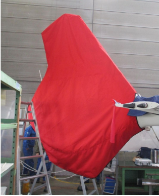
Airbus EC145 Tailfan Housing Fenestron Cover

The Tailboom Cover details vary by model, but generally the helicopter tail boom cover encloses the tail boom from the "bottleneck" to the aft end. They usually also cover the horizontal stabilizers, and are custom made to allow for antennae, lights, and other protrusions. They attach with straps underneath the tail boom. Covers for the vertical and horizontal stabilizers are also available separately. Specific information for each model is available on request.