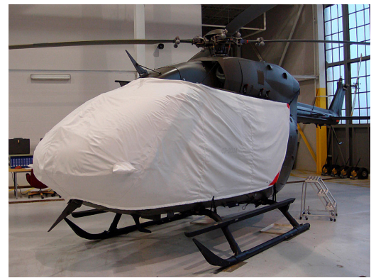
EC-145 Bubble Cover