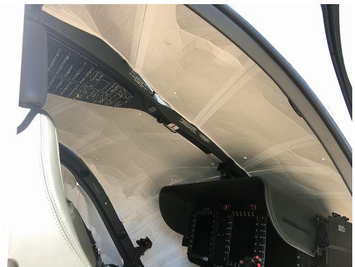
Eurocopter EC-145 Cockpit Heatshields