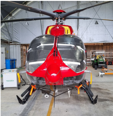
Airbus Helicopter H145D3 Windshield Heatshields, Engine Plugs

The Engine Inlet Plugs are custom fit for your Airbus Helicopter H145, UH-145, BK-117 D-2, D-3 intakes, made with heavy-duty vinyl material, and stuffed with a single block of sculpted urethane foam. Each plug has a zipper that allows the foam to be removed and dried if necessary. Engine plugs have 'Remove Before Flight' streamers sewn onto the face of the plugs. Most plugs are imprinted with the aircraft registration number in black for an extra charge. Storage bag NOT included. Engine plugs may be inserted after flight when the engine is still warm. Engine Inlet Plugs are commonly referred to as Cowl Plugs, Intake Plugs, Cowl Blocks, Engine Blocks, and Engine Bunges.