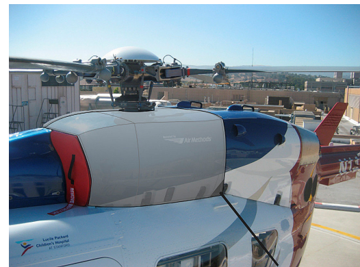
Upper Deck Plugs/Cover