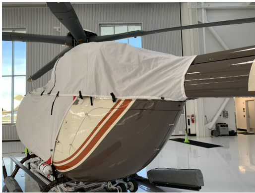
Eurocopter 145 Engine Area Cover, Bubble Cover

The Engine Inlet Plugs are custom fit for your Airbus Helicopter EC-145, UH-145, BK-117 D-2 intakes, made with heavy-duty vinyl material, and stuffed with a single block of sculpted urethane foam. Each plug has a zipper that allows the foam to be removed and dried if necessary. Engine plugs have 'Remove Before Flight' streamers sewn onto the face of the plugs. Most plugs are imprinted with the aircraft registration number in black for an extra charge. Storage bag NOT included. Engine plugs may be inserted after flight when the engine is still warm. Engine Inlet Plugs are commonly referred to as Cowl Plugs, Intake Plugs, Cowl Blocks, Engine Blocks, and Engine Bungs.