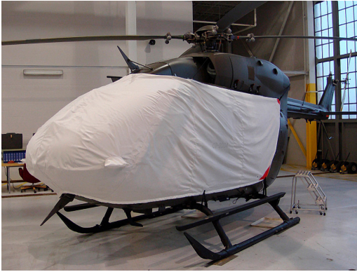
EC-145 Bubble Cover

This cover type is made from Silver Acrylic Sunbrella canvas and is 100% lined with a soft and smooth microfiber. Bruce's Custom Covers developed this material combination especially for aircraft protection. The outer material is medium weight and treated for water resistance, UV resistance and anti-static buildup. The inner lining is a very soft and smooth microfiber to prevent scratching. The material is very reflective, and tests show that the cabin interior temperature can be reduced to near-ambient temperature on the hottest of days. It is water, ice and snow repellent, yet breathable to allow moisture to escape from between the cover and the aircraft surface.