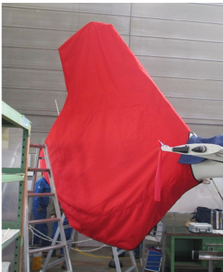
Eurocopter EC-145 D2 Main Body Cover, Tailboom/Fenestron Cover