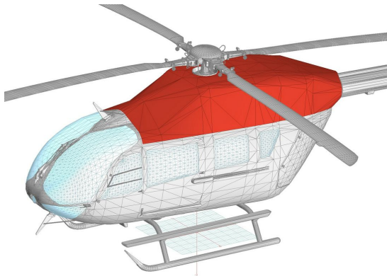
Intake/Exhaust Engine Area Cover, 3D Rendering

The Engine Inlet Plugs are custom fit for your Airbus Helicopter H145, UH-145, BK-117 D-2, D-3 intakes, made with heavy-duty vinyl material, and stuffed with a single block of sculpted urethane foam. Each plug has a zipper that allows the foam to be removed and dried if necessary. Engine plugs have 'Remove Before Flight' streamers sewn onto the face of the plugs. Most plugs are imprinted with the aircraft registration number in black for an extra charge. Storage bag NOT included. Engine plugs may be inserted after flight when the engine is still warm. Engine Inlet Plugs are commonly referred to as Cowl Plugs, Intake Plugs, Cowl Blocks, Engine Blocks, and Engine Bunges.