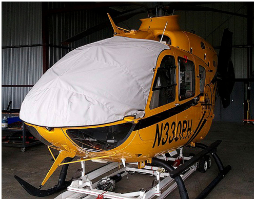
Bubble Cover w/ nose mounted radome & Upper Deck Plugs/Cover EC-135 Windshield/Skylights Cover, pinches in door jambs