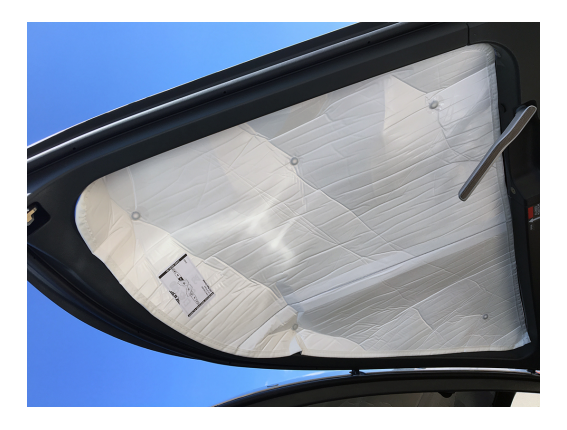
Aerospatiale AS350 Astar, Ecureuil, Esquilo, Fennec Windshield Heatshields