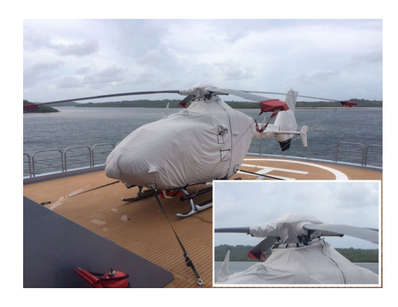
Airbus Helicopter AH135 Main Rotor Hub Cover

The Airbus Helicopter EC-135 Intake Cover. Details vary by model, but generally helicopter intake covers are designed to enclose the intake are only. They are smaller than helicopter engine covers, and their attachment details can vary from straps, to snaps, or some combination of the two. Specific information for each model is available on request.