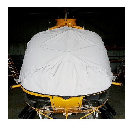
EC-135 Windshield/Skylights Cover, pinches in door jambs