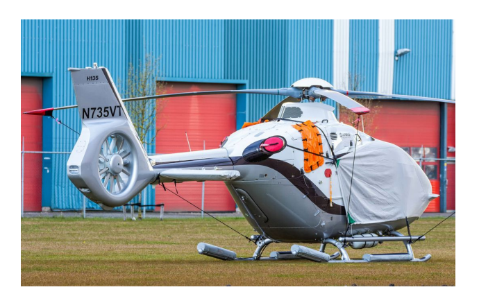
Airbus EC135T3 Blade Tie-Downs