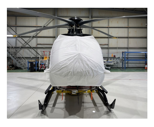
Airbus EC-135 Bubble Cover (with Wire Strike)