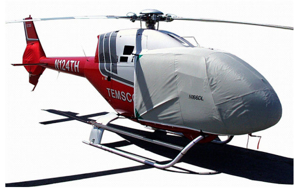
Eurocopter EC-120 Bubble Cover & Tailfan Cover