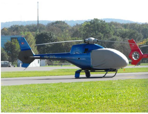
EC-130 Bubble, Tailfan, and Rotor Hub Cover