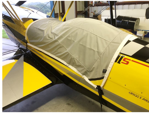
Acro Sport Acro II, Acroduster Travel Cover, Light Weight Travel Canopy Cover