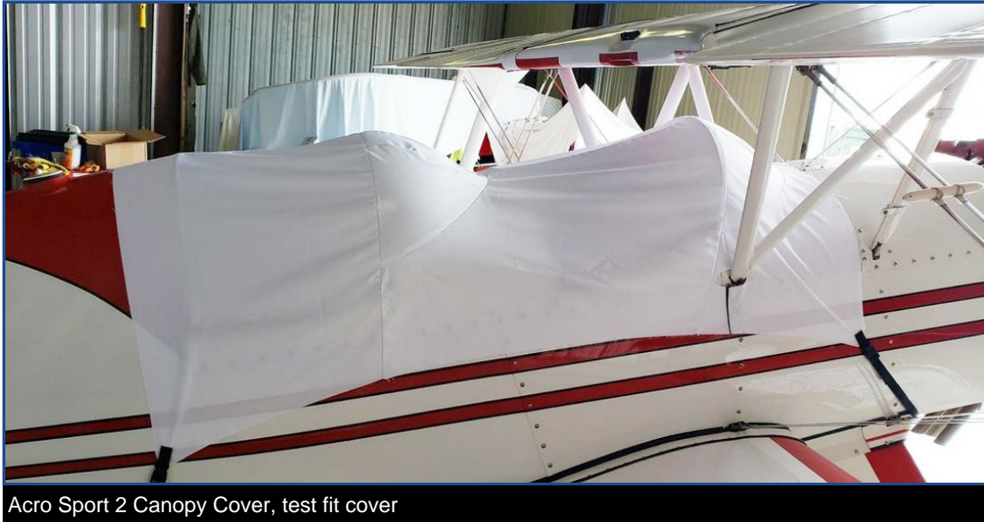
Acro Sport 2 Canopy Cover, test fit cover