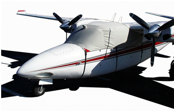
Aero Commander 680 Canopy Cover