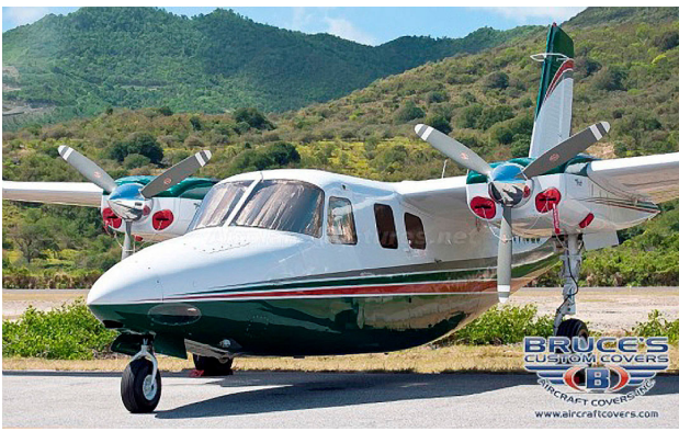
Aero Commander 500 Engine Inlet Plugs