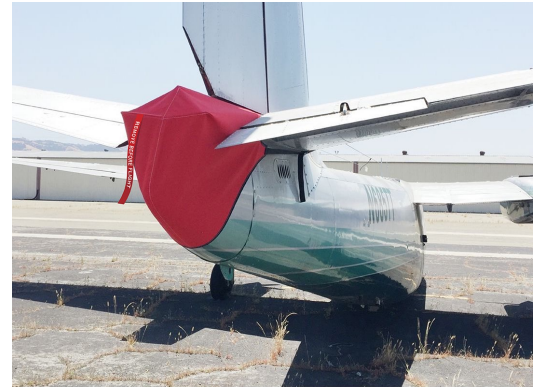
Rockwell Aero Commander Tailcone Cover