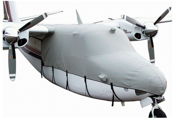
Canopy/Nose Cover (extends over top past leading edge)