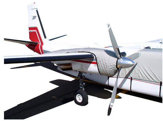
Aero Commander Insulated Engine Cover