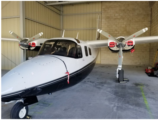
Aero Commander 500-A Pitot Covers