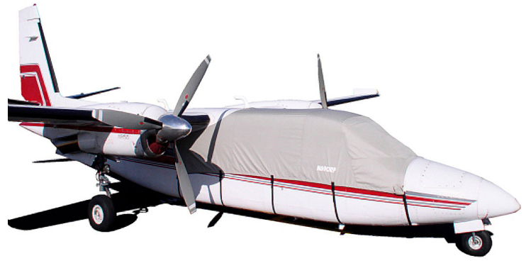
Aero Commander 690b Canopy Cover