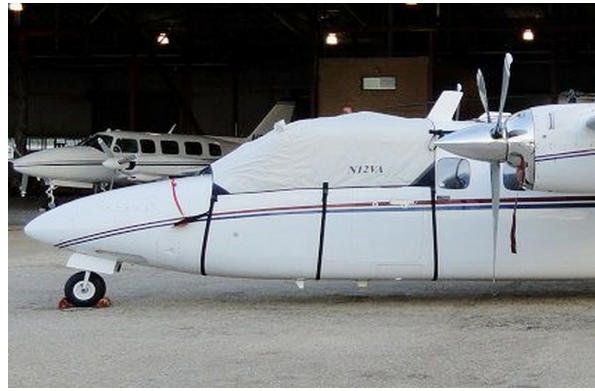
Rockwell Aero Commander 685, 690 & 840 Cockpit Cover