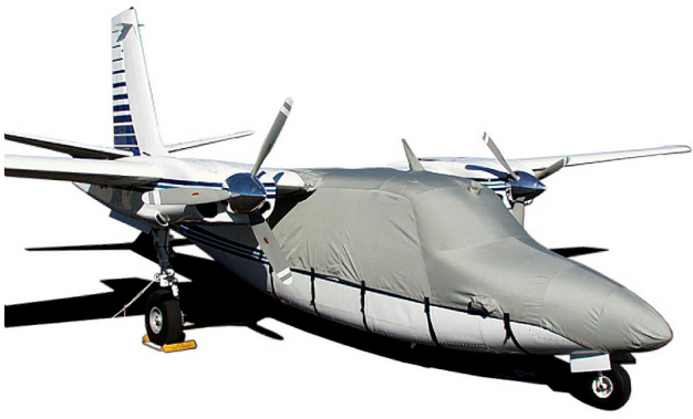
Aero Commander 500S Canopy/Nose Cover