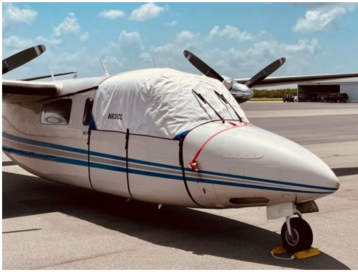
Aero Commander 690C Cockpit Cover