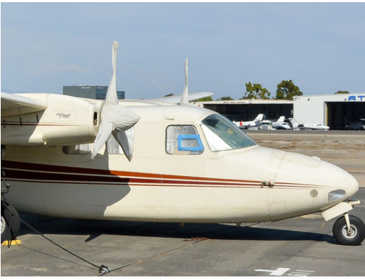
Aero Commander AC500 Ptopellor/Spinner Covers