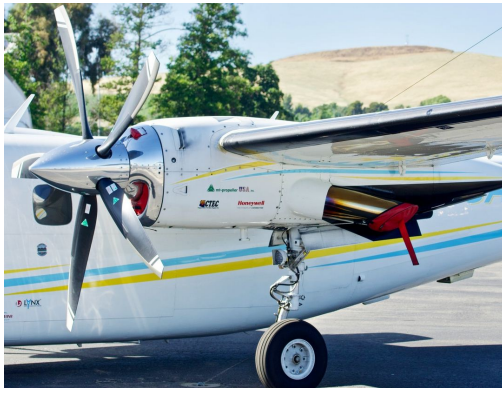
Aero Commander 690B Engine Inlet & Exhaust Plugs