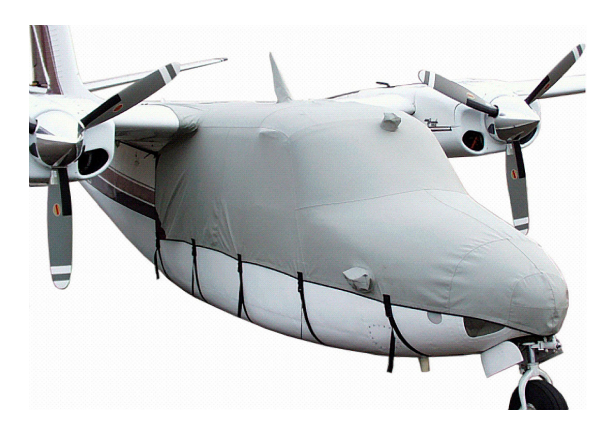
Canopy/Nose Cover (extends over top past leading edge)