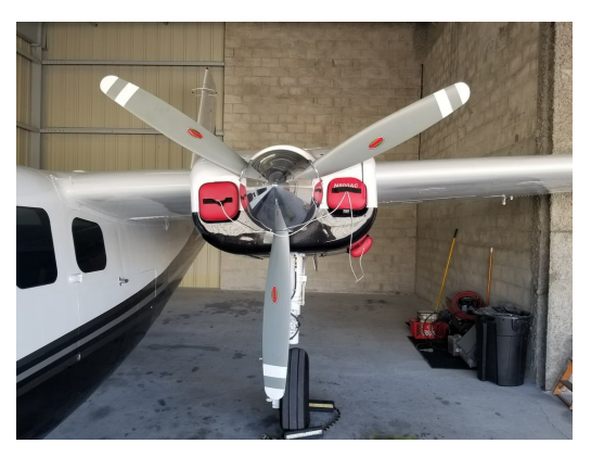
Aero Commander 500-A Engine Plug Set