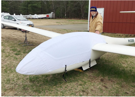
Grob 102 Astir CS Canopy/Nose Cover (test fit)