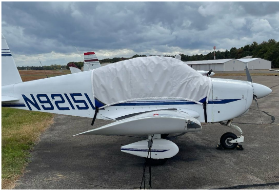
Grumman AA-1 Canopy Cover

This cover type is made from Silver Acrylic Sunbrella canvas and is 100% lined with a soft and smooth microfiber. Bruce's Custom Covers developed this material combination especially for aircraft protection. The outer material is medium weight and treated for water resistance, UV resistance and anti-static buildup. The inner lining is a very soft and smooth microfiber to prevent scratching. The material is very reflective, and tests show that the cabin interior temperature can be reduced to near-ambient temperature on the hottest of days. It is water, ice and snow repellent, yet breathable to allow moisture to escape from between the cover and the aircraft surface.