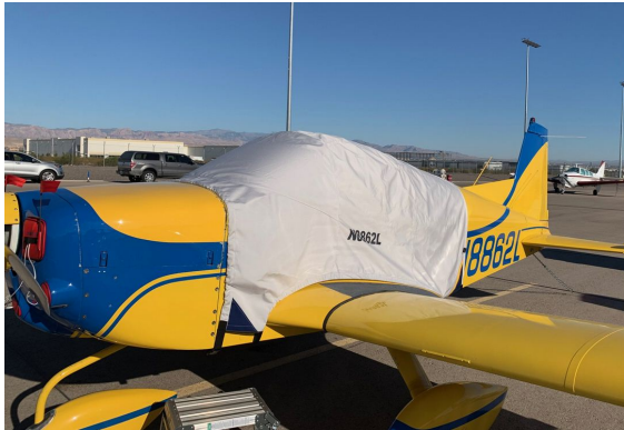
Grumman American AA1-B Extended Canopy Cover

and dried if necessary. Engine plugs have warning flags that are visible from the cockpit or 'remove before flight' streamers sewn onto the face of the plugs. Most plugs are imprinted with the aircraft registration number in black for an extra charge. Storage bag NOT included. Engine plugs may be inserted after flight when the engine is still warm. Engine Inlet Plugs are commonly referred to as Cowl Plugs, Intake Plugs, Cowl Blocks, Engine Blocks, and Engine Bungs.