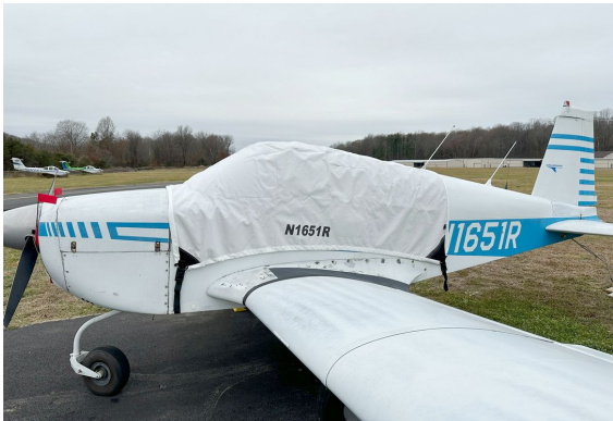
Grumman AA1 Canopy Cover

This cover type is made from Silver Acrylic Sunbrella canvas and is 100% lined with a soft and smooth microfiber. Bruce's Custom Covers developed this material combination especially for aircraft protection. The outer material is medium weight and treated for water resistance, UV resistance and anti-static buildup. The inner lining is a very soft and smooth microfiber to prevent scratching. The material is very reflective, and tests show that the cabin interior temperature can be reduced to near-ambient temperature on the hottest of days. It is water, ice and snow repellent, yet breathable to allow moisture to escape from between the cover and the aircraft surface.