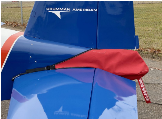
Grumman AA-1 Tailcone Cover

WINTER USE MATERIAL - Made with Solution-Dyed Polyester fabric, this option is intended for seasonal use to aid in deicing, rain mitigation, or for occasional travel. The material is lighter and more compact, but more susceptible to UV damage and may have a shorter useful life if used continuously outside than the all-year use material.