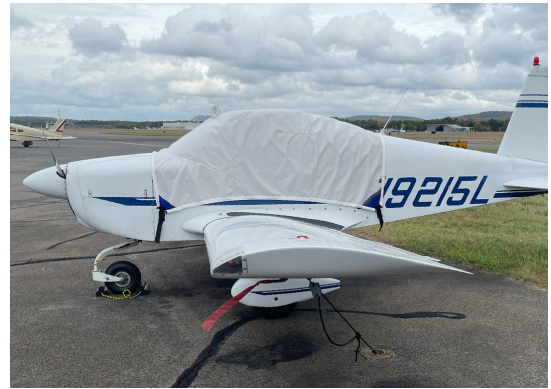
Grumman AA-1 Canopy Cover