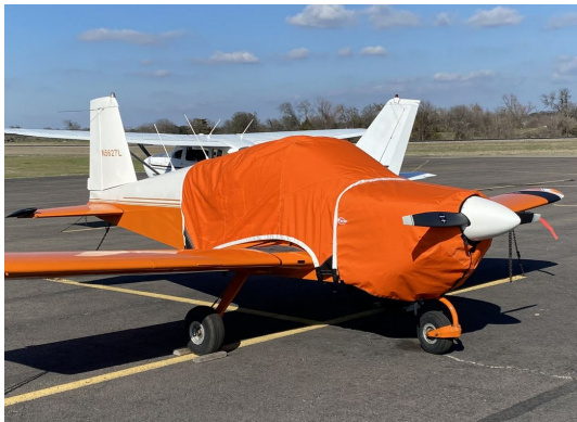
AA-1 Extended Canopy & Fully Enclosed Engine Cover

This cover type is made from Silver Acrylic Sunbrella canvas and is 100% lined with a soft and smooth microfiber. Bruce's Custom Covers developed this material combination especially for aircraft protection. The outer material is medium weight and treated for water resistance, UV resistance and anti-static buildup. The inner lining is a very soft and smooth microfiber to prevent scratching. The material is very reflective, and tests show that the cabin interior temperature can be reduced to near-ambient temperature on the hottest of days. It is water, ice and snow repellent, yet breathable to allow moisture to escape from between the cover and the aircraft surface.