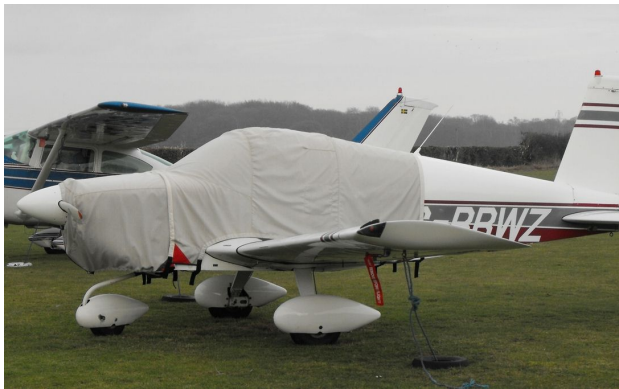
Grumman AA1 Extended Canopy Cover, Engine Cover