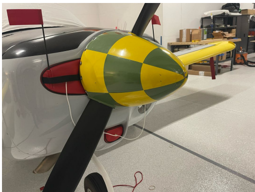
Grumman AA-1B Engine Inlet Plugs (set of 3)

and dried if necessary. Engine plugs have warning flags that are visible from the cockpit or 'remove before flight' streamers sewn onto the face of the plugs. Most plugs are imprinted with the aircraft registration number in black for an extra charge. Storage bag NOT included. Engine plugs may be inserted after flight when the engine is still warm. Engine Inlet Plugs are commonly referred to as Cowl Plugs, Intake Plugs, Cowl Blocks, Engine Blocks, and Engine Bungs.