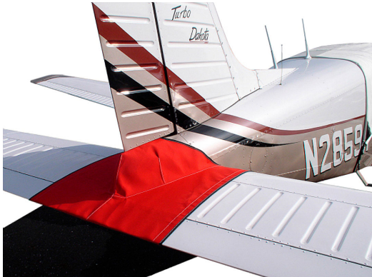
Piper PA-28 Tailcone Cover