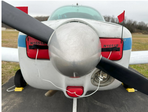
Grumman AA-1B Engine Inlet Plugs