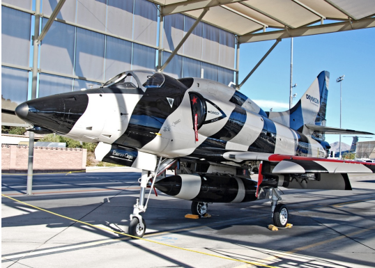
A4 Skyhawk Engine Inlet Plugs

The Engine Inlet Plugs are custom fit for your McDonnell Douglas A-4 Skyhawk, single & tandem intakes, made with heavy-duty vinyl material, and stuffed with a single block of sculpted urethane foam. Each plug has a zipper that allows the foam to be removed and dried if necessary. Engine plugs have 'remove before flight' streamers sewn onto the face of the plugs. Most plugs are imprinted with the aircraft registration number in black for an extra charge. Storage bag NOT included. Engine plugs may be inserted after flight when the engine is still warm. Engine Inlet Plugs are commonly referred to as Cowl Plugs, Intake Plugs, Cowl Blocks, Engine Blocks, and Engine Bunges.