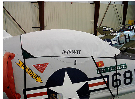
A-4 Skyhawk Canopy Cover