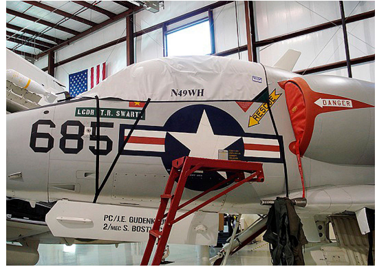
A-4 Skyhawk Canopy Cover