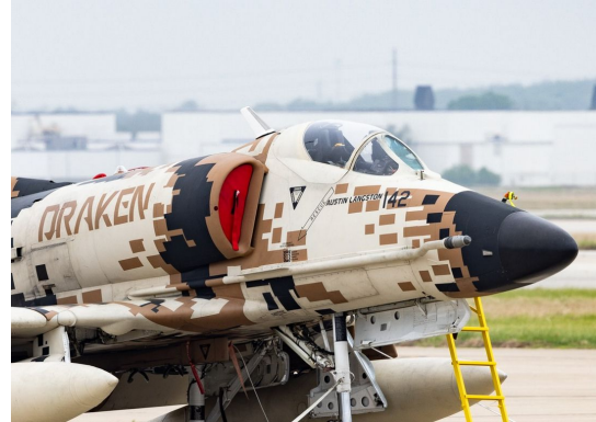
McDonnell Douglas A4 Skyhawk Engine Intake Plugs