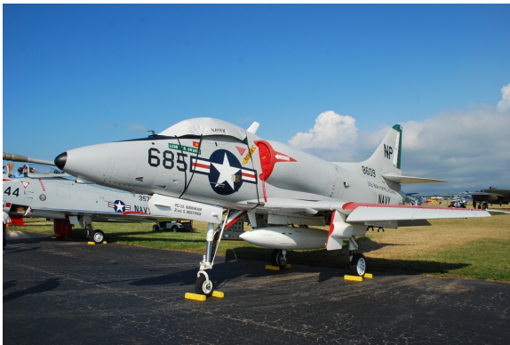
A-4 Skyhawk Canopy Cover

This cover type is made from Silver Acrylic Sunbrella canvas and is 100% lined with a soft and smooth microfiber. Bruce's Custom Covers developed this material combination especially for aircraft protection. The outer material is medium weight and treated for water resistance, UV resistance and anti-static buildup. The inner lining is a very soft and smooth microfiber to prevent scratching. The material is very reflective, and tests show that the cabin interior temperature can be reduced to near-ambient temperature on the hottest of days. It is water, ice and snow repellent, yet breathable to allow moisture to escape from between the cover and the aircraft surface.