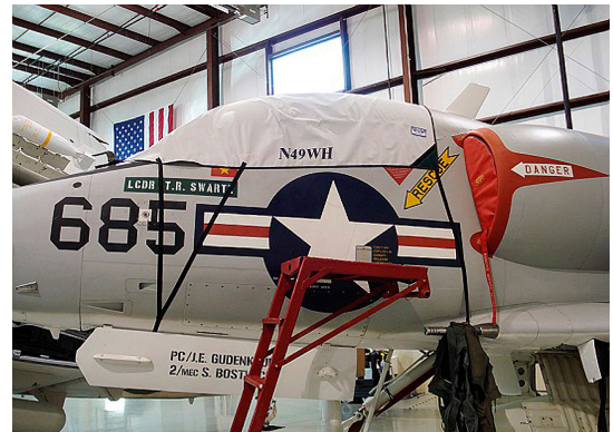
A-4 Skyhawk Canopy Cover