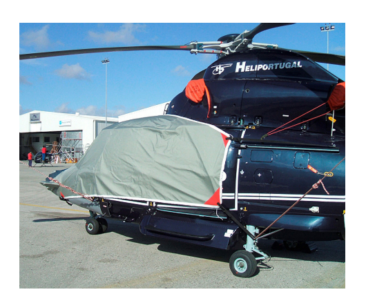
Dauphin Bubble Cover, extended nose