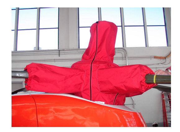
MH-65C Rotor Hub Cover w/ OADS Tube Cover detail

Insulated Covers Material - A special composite material of solution-dyed polyester, 3M Thinsulate insulation, and soft nylon interior fabric. Our insulated covers are designed to complement an engine preheater and help retain heat in the engine compartment after shutdown. If you operate your aircraft in cold-weather, these covers will help prevent engine wear and tear.