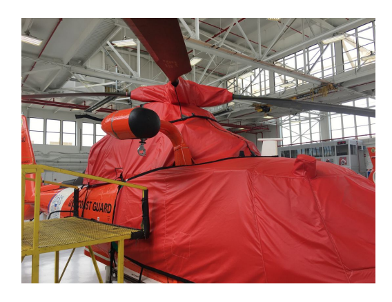
MH-65C Bubble Cover, extended Nose/Radome Model, padded over U.S. Coast Guard HH-65 Dolphin Bubble, Engine & Rotor windows, P/N: A365-210 Mast Covers