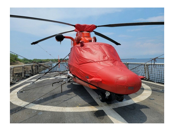
Aerospatiale AS365N2 Bubble, w/Extended Nose/Radome

This cover type is made from Silver Acrylic Sunbrella canvas and is 100% lined with a soft and smooth microfiber. Bruce's Custom Covers developed this material combination especially for aircraft protection. The outer material is medium weight and treated for water resistance, UV resistance and anti-static buildup. The inner lining is a very soft and smooth microfiber to prevent scratching. The material is very reflective, and tests show that the cabin interior temperature can be reduced to near-ambient temperature on the hottest of days. It is water, ice and snow repellent, yet breathable to allow moisture to escape from between the cover and the aircraft surface.