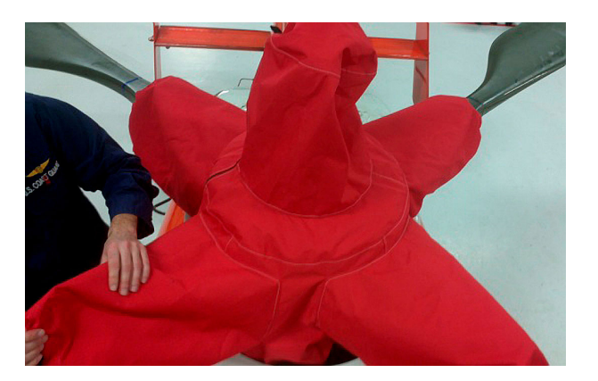
MH-65C Rotor Hub Cover w/ OADS Tube Cover detail