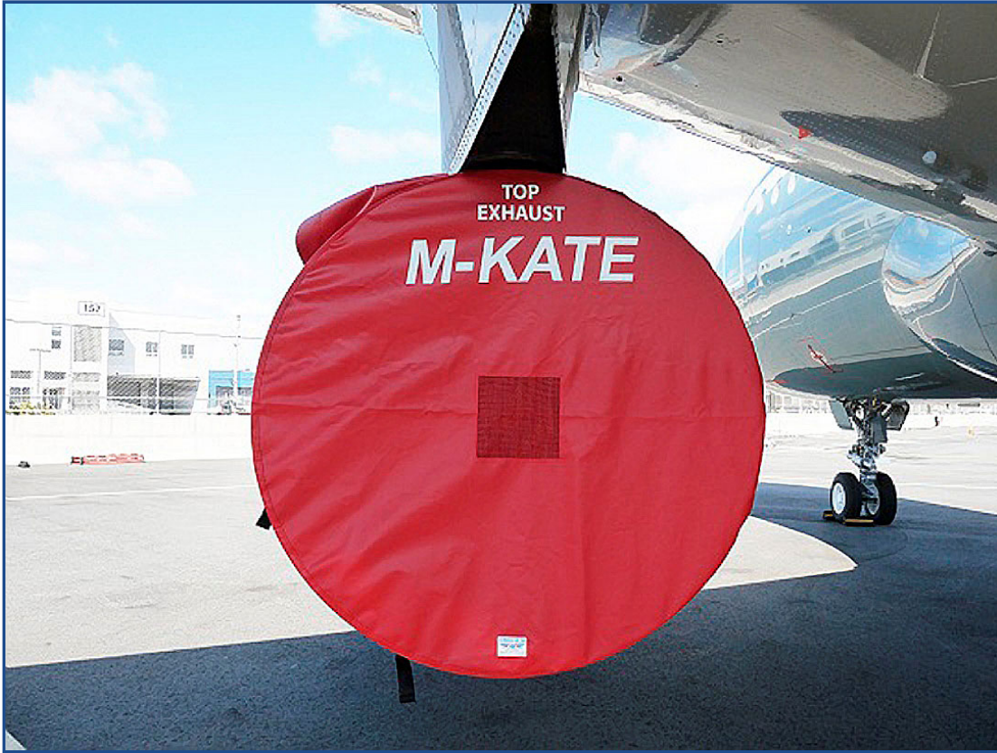
Airbus A319 Intake/Exhaust Covers set, IAE V2500