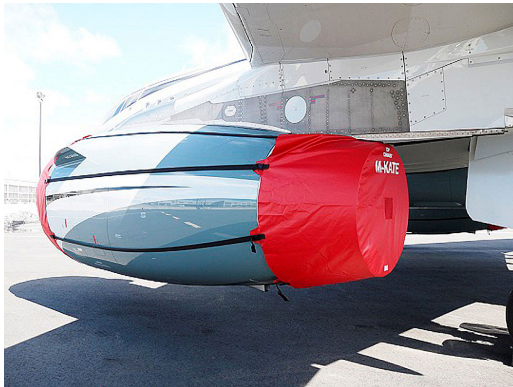
Airbus A319 Intake/Exhaust Covers set, IAE V2500

The Engine Inlet Plugs are custom fit for your Airbus A340 intakes, made with heavy-duty vinyl material, and stuffed with a single block of sculpted urethane foam. Each plug has a zipper that allows the foam to be removed and dried if necessary. Engine plugs have 'remove before flight' streamers sewn onto the face of the plugs. Most plugs are imprinted with the aircraft registration number in black for an extra charge. Storage bag NOT included. Engine plugs may be inserted after flight when the engine is still warm. Engine Inlet Plugs are commonly referred to as Cowl Plugs, Intake Plugs, Cowl Blocks, Engine Blocks, and Engine Bungs.