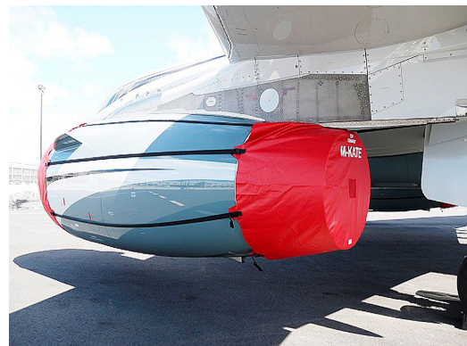
Airbus A319 Intake/Exhaust Covers set, IAE V2500