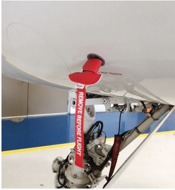
Grumman Gulfstream G-V Rosemont/TAT Cover

The Engine Exhaust Plugs are custom fit for your Airbus A330, A350 exhaust openings, made with heavy-duty vinyl material, and stuffed with a single block of sculpted urethane foam. Each plug has a zipper that allows the foam to be removed and dried if necessary. Exhaust plugs have 'remove before flight' streamers sewn onto the face of the plugs. Most plugs are imprinted with the aircraft registration number in black for an extra charge. Exhaust plugs may be inserted soon after flight when the engine is still warm. Engine Inlet Plugs are commonly referred to as Cowl Plugs, Intake Plugs, Cowl Blocks, Engine Blocks, and Engine Bungs.