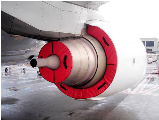
Boeing 737 Bypass and Exhaust Plugs

The Engine Exhaust Plugs are custom fit for your Airbus A330, A350 exhaust openings, made with heavy-duty vinyl material, and stuffed with a single block of sculpted urethane foam. Each plug has a zipper that allows the foam to be removed and dried if necessary. Exhaust plugs have 'remove before flight' streamers sewn onto the face of the plugs. Most plugs are imprinted with the aircraft registration number in black for an extra charge. Exhaust plugs may be inserted soon after flight when the engine is still warm. Engine Inlet Plugs are commonly referred to as Cowl Plugs, Intake Plugs, Cowl Blocks, Engine Blocks, and Engine Bungs.