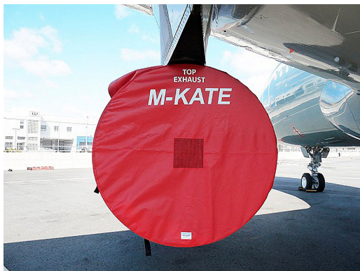
Airbus A319 Intake/Exhaust Covers set, IAE V2500