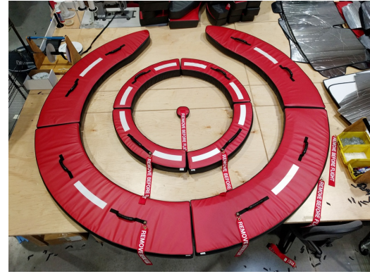
Boeing 747-8 Exhaust Plugs