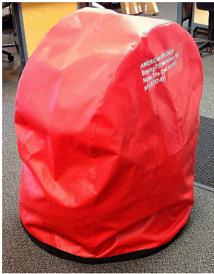
Boeing 757 Tire Covers, Wash Down or Long-term Storage

ALL-YEAR USE MATERIAL - Made with Silver Acrylic Sunbrella canvas, the all-year use material is the best option for sun protection and cover longevity. This heavier more durable material is intended for all weather conditions, such as rain and snow or lots of sun.