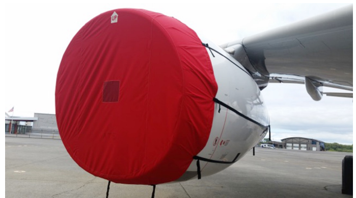
Airbus A330 Intake Cover, Trent 700 Engine