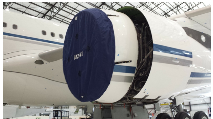
Airbus 340 Intake Covers