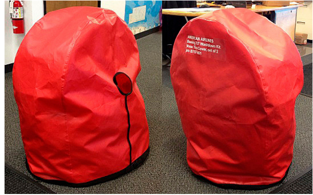
Boeing 757 Tire Covers, great for Wash Prep or Storage