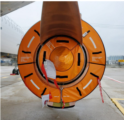
Airbus A320 Exhaust & Bypass Vent Plugs