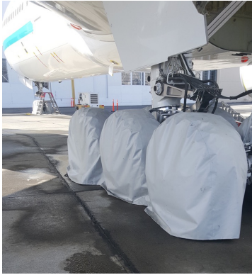
Boeing 777 Main & Nose Gear Tire Covers

ALL-YEAR USE MATERIAL - Made with Silver Acrylic Sunbrella canvas, the all-year use material is the best option for sun protection and cover longevity. This heavier more durable material is intended for all weather conditions, such as rain and snow or lots of sun.