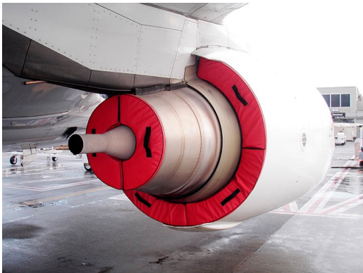
Boeing 737 NG Exhaust Plug Set, Folding Donut Ring Type

The Engine Inlet Plugs are custom fit for your Airbus A321 intakes, made with heavy-duty vinyl material, and stuffed with a single block of sculpted urethane foam. Each plug has a zipper that allows the foam to be removed and dried if necessary. Engine plugs have 'remove before flight' streamers sewn onto the face of the plugs. Most plugs are imprinted with the aircraft registration number in black for an extra charge. Storage bag NOT included. Engine plugs may be inserted after flight when the engine is still warm. Engine Inlet Plugs are commonly referred to as Cowl Plugs, Intake Plugs, Cowl Blocks, Engine Blocks, and Engine Bungs.