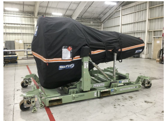
CFM56-5B Off Link Cover, fully enclosed