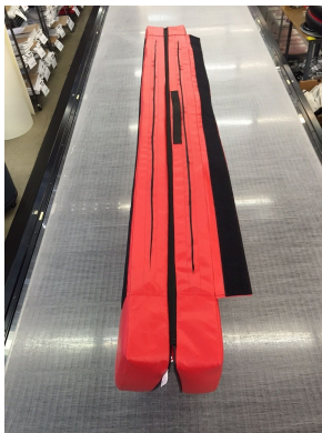
Boeing 737 Max Intake Plug, folding type

The Engine Inlet Plugs are custom fit for your Airbus A320 intakes, made with heavy-duty vinyl material, and stuffed with a single block of sculpted urethane foam. Each plug has a zipper that allows the foam to be removed and dried if necessary. Engine plugs have 'remove before flight' streamers sewn onto the face of the plugs. Most plugs are imprinted with the aircraft registration number in black for an extra charge. Storage bag NOT included. Engine plugs may be inserted after flight when the engine is still warm. Engine Inlet Plugs are commonly referred to as Cowl Plugs, Intake Plugs, Cowl Blocks, Engine Blocks, and Engine Bungs.