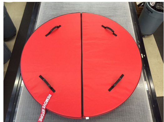
Boeing 737 Max Intake Plug, folding type