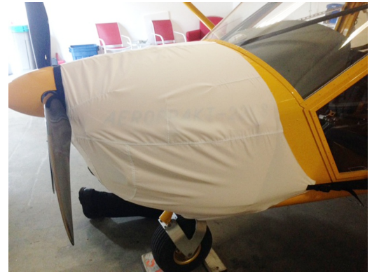
A-22 Engine Cover, test fit