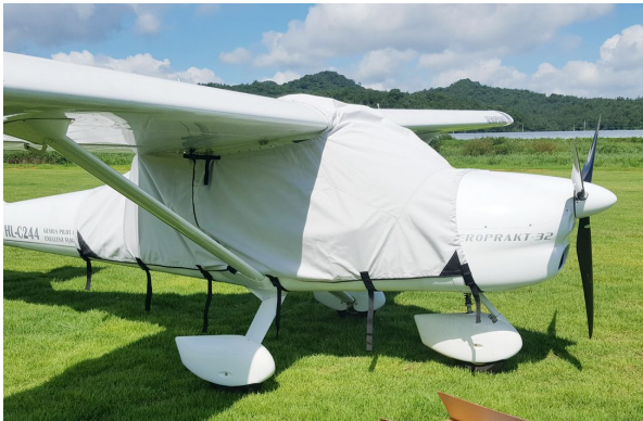
Aeroprakt A-32 Vixen Canopy Cover, Over-Top Type

This cover type is made from Silver Acrylic Sunbrella canvas and is 100% lined with a soft and smooth microfiber. Bruce's Custom Covers developed this material combination especially for aircraft protection. The outer material is medium weight and treated for water resistance, UV resistance and anti-static buildup. The inner lining is a very soft and smooth microfiber to prevent scratching. The material is very reflective, and tests show that the cabin interior temperature can be reduced to near-ambient temperature on the hottest of days. It is water, ice and snow repellent, yet breathable to allow moisture to escape from between the cover and the aircraft surface.