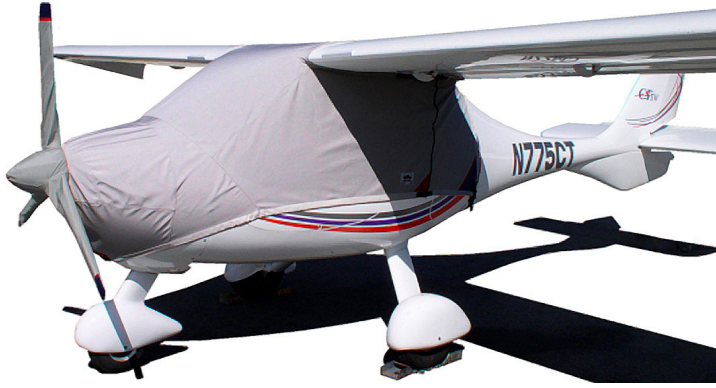
Flight Design CT Canopy/Engine Cover

occasional use outside. We also have an ultra lightweight material available for fitted hangar dust covers. For daily outdoor use, the non-travel Sunbrella Cover is the best choice.