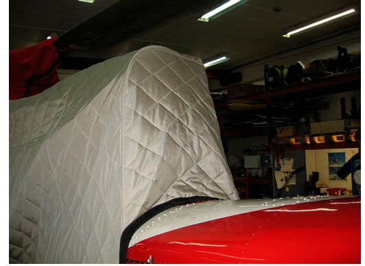
Alouette III Rotor Hub Cover, Insulated Engine/Transmission Cover