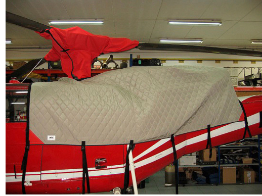
Alouette III Rotor Hub Cover, Insulated Engine/Transmission Cover