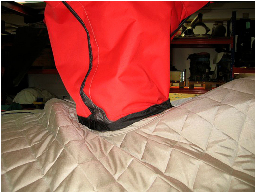
Alouette III Rotor Hub Cover, Insulated Engine/Transmission Cover Alouette III Rotor Hub Cover & Engine/Transmission Cover