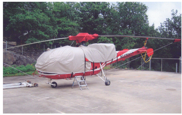
Alouette III Bubble, Rotor Hub & Engine Covers, Blade Tie-Downs