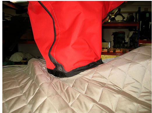
Alouette III Bubble, Rotor Hub & Engine Covers, Blade Tie-Downs Alouette III Rotor Hub Cover & Engine/Transmission Cover