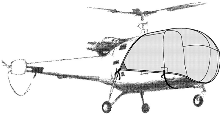
Bubble Cover for the Alouette III