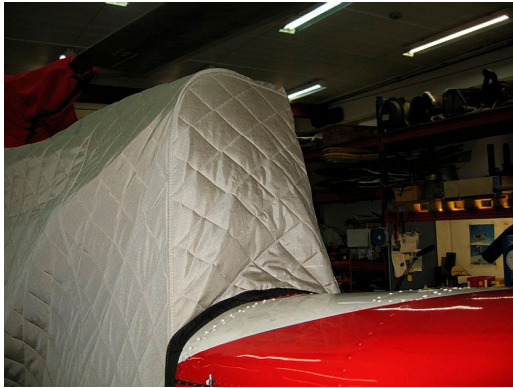
Alouette III Insulated Engine/Transmission Cover

WINTER USE MATERIAL - Made with Solution-Dyed Polyester fabric, this option is intended for seasonal use to aid in deicing, rain mitigation, or for occasional travel. The material is lighter and more compact, but more susceptible to UV damage and may have a shorter useful life if used continuously outside than the all-year use material.