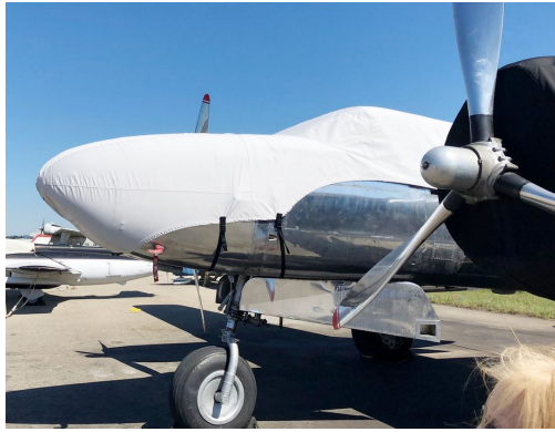
Douglas A26 Invader Cockpit/Nose Cover

the hottest of days. It is water, ice and snow repellent, yet breathable to allow moisture to escape from between the cover and the aircraft surface.