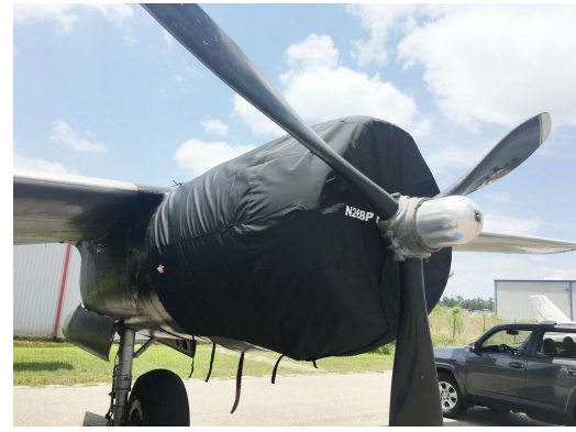
Douglas A-26 Engine Cover