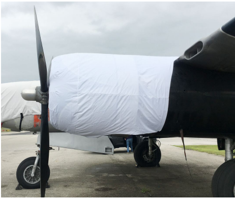
Douglas A-26 Engine Cover, test fit cover