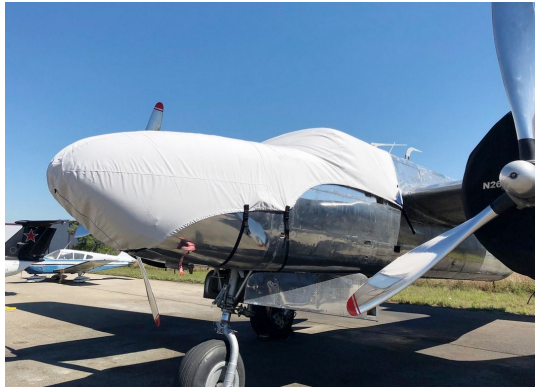
Douglas A26 Invader Cockpit/Nose Cover

the hottest of days. It is water, ice and snow repellent, yet breathable to allow moisture to escape from between the cover and the aircraft surface.