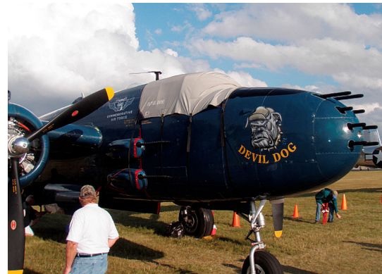
Mitchell B25 Cockpit Cover w/ Custom Imprint (Bellystrap Type)