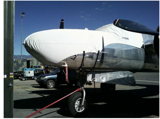
Douglas A26 Invader Cockpit/Nose Cover