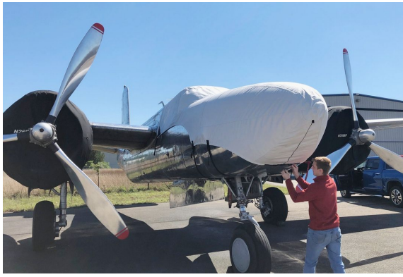
Douglas A26 Invader Cockpit/Nose Cover