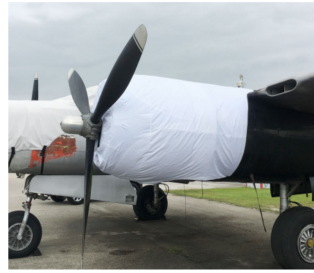
Douglas A-26 Engine Cover, test fit cover