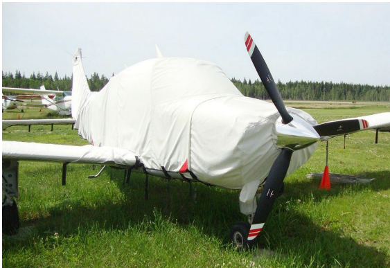
Beech Sierra Engine, Extended Canopy, Empennage, & Wing Covers