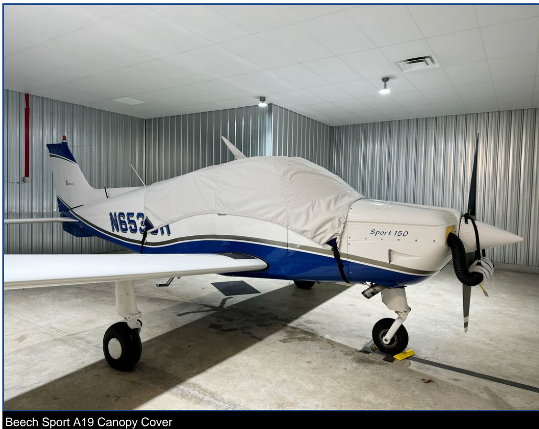
Beech Sport A19 Canopy Cover