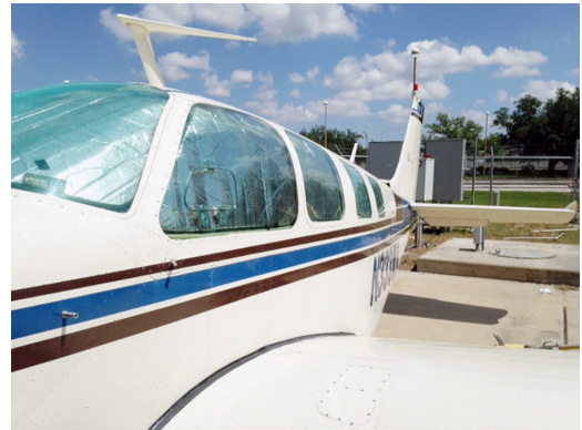
Beech Bonanza HeatShields