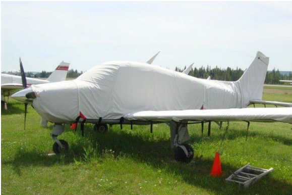
Beech Sierra Engine, Extended Canopy, Empennage, & Wing Covers