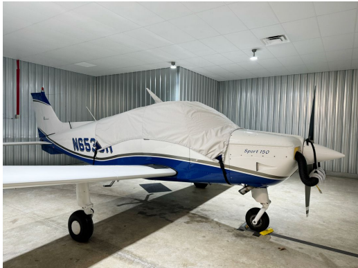
Beech Sport A19 Canopy Cover

This cover type is made from Silver Acrylic Sunbrella canvas and is 100% lined with a soft and smooth microfiber. Bruce's Custom Covers developed this material combination especially for aircraft protection. The outer material is medium weight and treated for water resistance, UV resistance and anti-static buildup. The inner lining is a very soft and smooth microfiber to prevent scratching. The material is very reflective, and tests show that the cabin interior temperature can be reduced to near-ambient temperature on the hottest of days. It is water, ice and snow repellent, yet breathable to allow moisture to escape from between the cover and the aircraft surface.