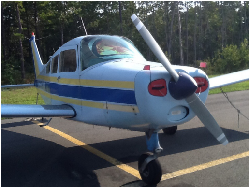
Beech Musketeer Engine Inlet Plugs

plugs have warning flags that are visible from the cockpit or 'remove before flight' streamers sewn onto the face of the plugs. Most plugs are imprinted with the aircraft registration number in black for an extra charge. Storage bag NOT included. Engine plugs may be inserted after flight when the engine is still warm. Engine Inlet Plugs are commonly referred to as Cowl Plugs, Intake Plugs, Cowl Blocks, Engine Blocks, and Engine Bungs.