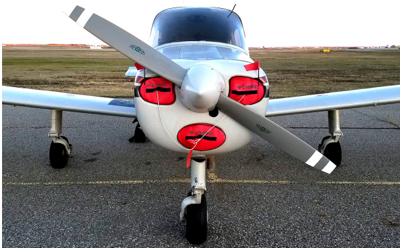
Beech Musketeer Engine Inlet Plugs