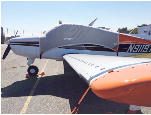
Beech Musketeer Canopy Cover