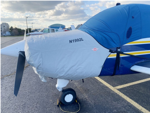
Beech C23 Sundowner Insulated Engine Cover

This cover type is made from Silver Acrylic Sunbrella canvas and is 100% lined with a soft and smooth microfiber. Bruce's Custom Covers developed this material combination especially for aircraft protection. The outer material is medium weight and treated for water resistance, UV resistance and anti-static buildup. The inner lining is a very soft and smooth microfiber to prevent scratching. The material is very reflective, and tests show that the cabin interior temperature can be reduced to near-ambient temperature on the hottest of days. It is water, ice and snow repellent, yet breathable to allow moisture to escape from between the cover and the aircraft surface.