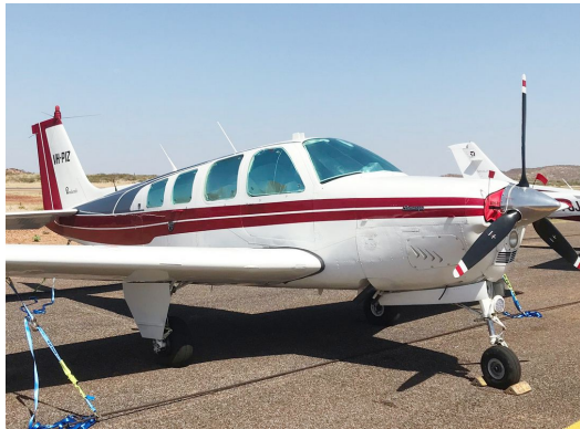
Beech A-36 Bonanza Cabin HeatShields

Windshield Heatshields are interior sunshades for an aircraft's front windshield. The product is a unique composite of closed-cell foam with a silver mylar finish. The semi-rigid design is stiff enough to stand along the inside of the windshield using sun visors or window framing. It folds up flat and easily stores in the included storage sleeve. Some designs may require velcro and suction cups or split right and left sides. A Heatshield is an excellent short-term remedy for cockpit overheating. An external fabric cover is far more effective and practical for long-term protection.