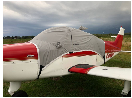
Beech Sundowner Travel Canopy Cover