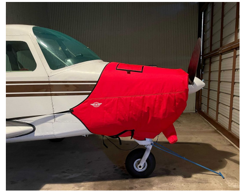
Beech Musketeer Insulated Engine Covers