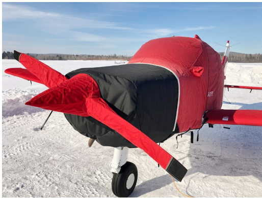
Beech Sundowner Extended Canopy, Wing, Engine & Prop Covers

This cover type is made from Silver Acrylic Sunbrella canvas and is 100% lined with a soft and smooth microfiber. Bruce's Custom Covers developed this material combination especially for aircraft protection. The outer material is medium weight and treated for water resistance, UV resistance and anti-static buildup. The inner lining is a very soft and smooth microfiber to prevent scratching. The material is very reflective, and tests show that the cabin interior temperature can be reduced to near-ambient temperature on the hottest of days. It is water, ice and snow repellent, yet breathable to allow moisture to escape from between the cover and the aircraft surface.