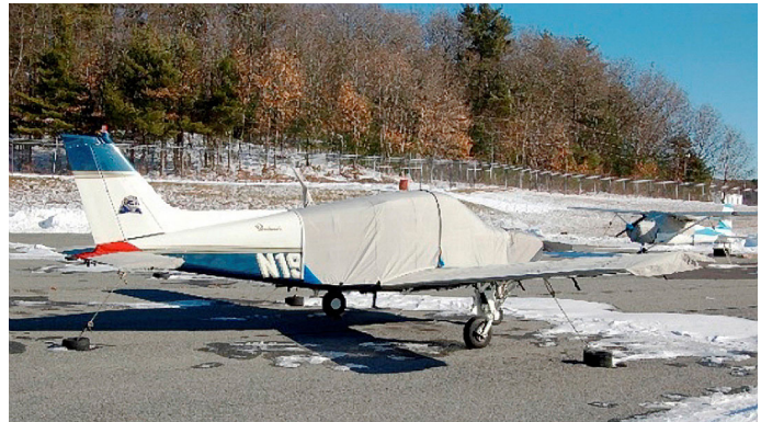
Beech Sierra Prop, Engine, Extended Canopy, Wing, Tailcone, and Horizontal Stab Covers.