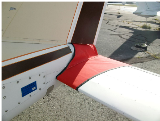
Beech Musketeer Tailcone Cover (Fully Enclosed)

WINTER USE MATERIAL - Made with Solution-Dyed Polyester fabric, this option is intended for seasonal use to aid in deicing, rain mitigation, or for occasional travel. The material is lighter and more compact, but more susceptible to UV damage and may have a shorter useful life if used continuously outside than the all-year use material.