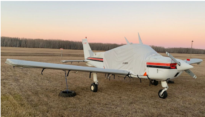
Sport B19 Engine Inlet Plugs

This cover type is made from Silver Acrylic Sunbrella canvas and is 100% lined with a soft and smooth microfiber. Bruce's Custom Covers developed this material combination especially for aircraft protection. The outer material is medium weight and treated for water resistance, UV resistance and anti-static buildup. The inner lining is a very soft and smooth microfiber to prevent scratching. The material is very reflective, and tests show that the cabin interior temperature can be reduced to near-ambient temperature on the hottest of days. It is water, ice and snow repellent, yet breathable to allow moisture to escape from between the cover and the aircraft surface.