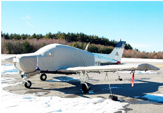
Prop, Engine, Extended Canopy, Wing, Tailcone, and Horizontal Stab Covers

Engine Inlet Plugs are custom fit for your Beech Musketeer A23 intakes, made with heavy-duty vinyl material, and stuffed with a single block of sculpted urethane foam. Each plug has a zipper that allows the foam to be removed and dried if necessary. Engine plugs have warning flags that are visible from the cockpit or 'remove before flight' streamers sewn onto the face of the plugs. Most plugs are imprinted with the aircraft registration number in black for an extra charge. Storage bag NOT included. Engine plugs may be inserted after flight when the engine is still warm. Engine Inlet Plugs are commonly referred to as Cowl Plugs, Intake Plugs, Cowl Blocks, Engine Blocks, and Engine Bungs.