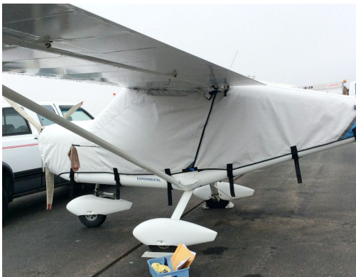
Aeroprakt A-22 Valor Canopy/Engine Cover

This cover type is made from Silver Acrylic Sunbrella canvas and is 100% lined with a soft and smooth microfiber. Bruce's Custom Covers developed this material combination especially for aircraft protection. The outer material is medium weight and treated for water resistance, UV resistance and anti-static buildup. The inner lining is a very soft and smooth microfiber to prevent scratching. The material is very reflective, and tests show that the cabin interior temperature can be reduced to near-ambient temperature on the hottest of days. It is water, ice and snow repellent, yet breathable to allow moisture to escape from between the cover and the aircraft surface.