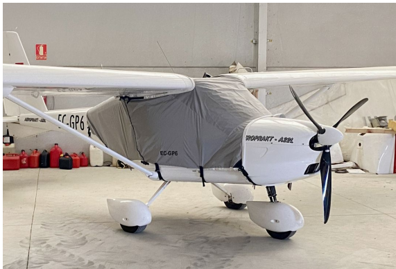
Aeroprakt A22 Over-Top Canopy Cover

Travel Covers are made with Silver Solution-Dyed Polyester fabric and only lined over the windshield to save weight. The material is lightweight and more compact for easy stowage in the aircraft. The polyester material is water resistant, but only intended for occasional use outside. We also have an ultra lightweight material available for fitted hangar dust covers. For daily outdoor use, the non-travel Sunbrella Cover is the best choice.