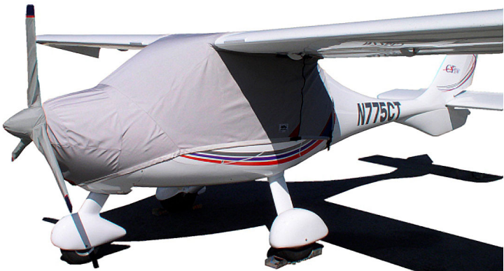
Eurofox LSA Extended Canopy Cover (same as an Aerotrek)