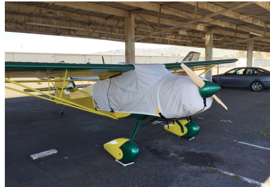
Kitfox Canopy & Engine Covers