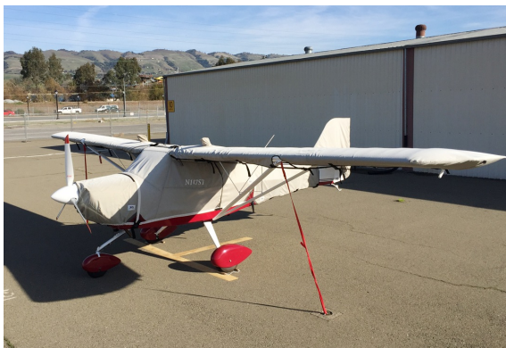
Eurofox Canopy, Engine, Wings and Empennage Covers

WINTER USE MATERIAL - Made with Solution-Dyed Polyester fabric, this option is intended for seasonal use to aid in deicing, rain mitigation, or for occasional travel. The material is lighter and more compact, but more susceptible to UV damage and may have a shorter useful life if used continuously outside than the all-year use material.