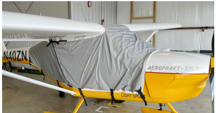
Aeroprakt A-22 Travel Weight Canopy Cover