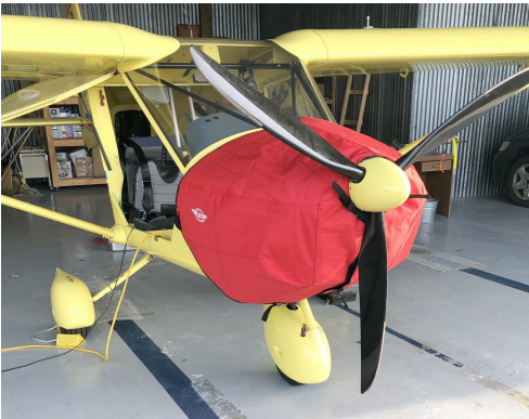
Aeroprakt A-22 Valor Insulated Engine Cover