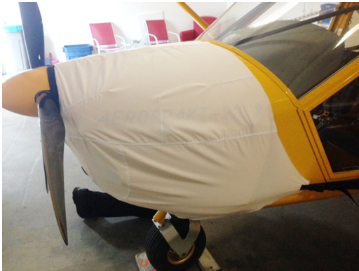
A-22 Engine Cover, test fit

Insulated Covers Material - A special composite material of solution-dyed polyester, 3M Thinsulate insulation, and soft nylon interior fabric. Our insulated covers are designed to complement an engine preheater and help retain heat in the engine compartment after shutdown. If you operate your aircraft in cold-weather, these covers will help prevent engine wear and tear.