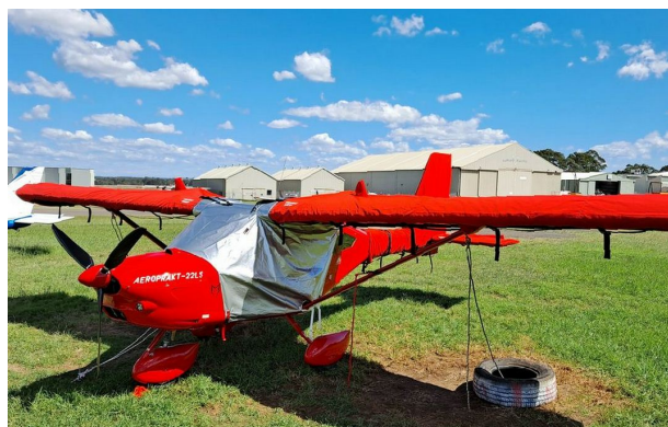
Aeroprakt A22 Wing & Empennage Covers