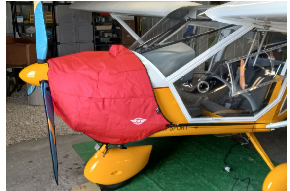
Aeroprakt A-22 Insulated Engine Cover