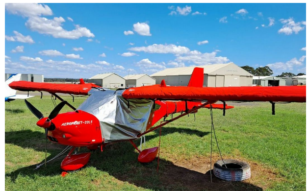
Aeroprakt A22 Wing & Empennage Covers