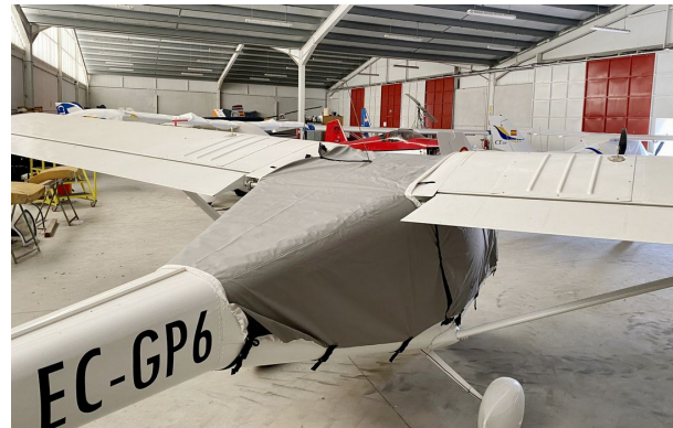
Aeroprakt A22 Over-Top Canopy Cover