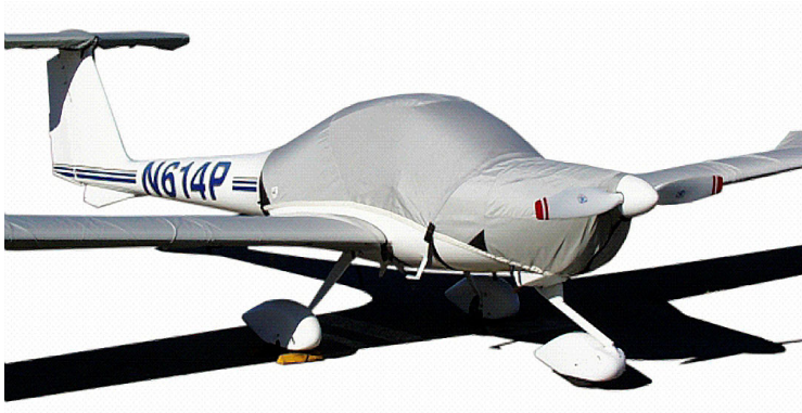
Diamond DA-20 Canopy/Engine, Wing & Horiz. Stab. Covers

This cover type is made from Silver Acrylic Sunbrella canvas and is 100% lined with a soft and smooth microfiber. Bruce's Custom Covers developed this material combination especially for aircraft protection. The outer material is medium weight and treated for water resistance, UV resistance and anti-static buildup. The inner lining is a very soft and smooth microfiber to prevent scratching. The material is very reflective, and tests show that the cabin interior temperature can be reduced to near-ambient temperature on the hottest of days. It is water, ice and snow repellent, yet breathable to allow moisture to escape from between the cover and the aircraft surface.