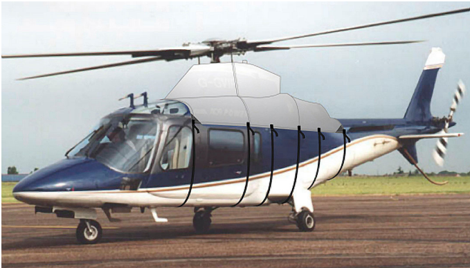
Agusta Power Engine Cover (illustration)