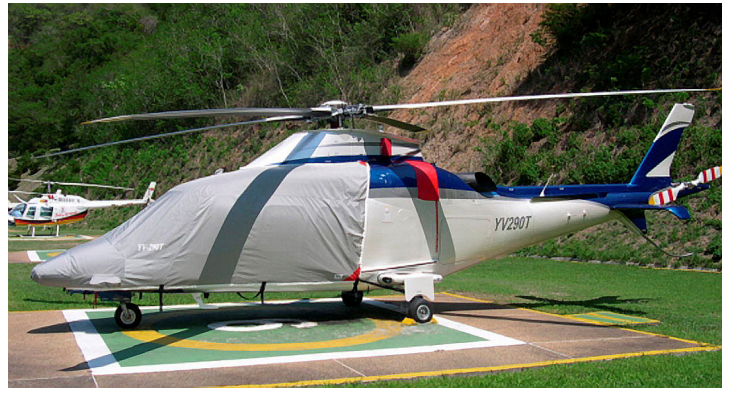
Agusta Grand Bubble Cover