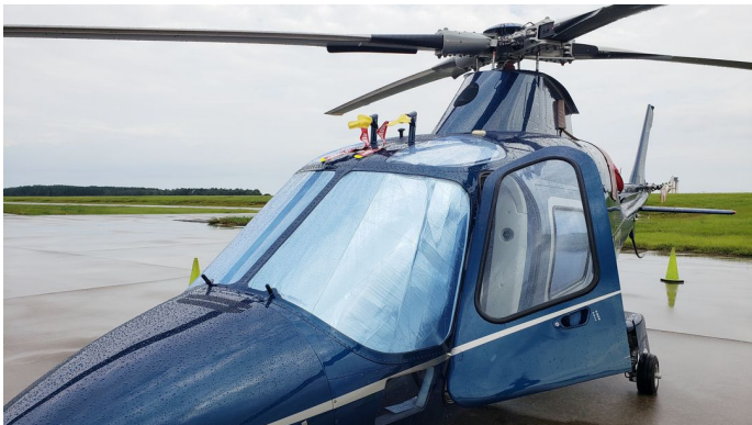
Agusta AW109S/SP Grand Heatshield Set

Cabin Heatshields are interior sunshades for the aircraft's passenger cabin area. The product is a unique composite of closed-cell foam with a silver mylar finish. The semi-rigid design is stiff enough to stand inside the window framing. The set folds up flat and is easily stored in the included storage sleeve. Some designs may require velcro and suction cups. A Heatshield is an excellent short-term remedy for cockpit overheating, but an external fabric cover is more effective for long-term protection.