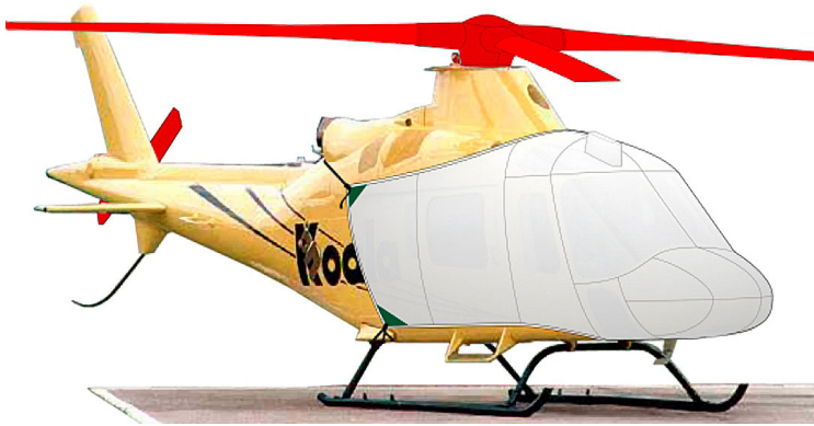
Koala Bubble, Rotor Hub, Blade & Tail Rotor Covers (illustration)

WINTER USE MATERIAL - Made with Solution-Dyed Polyester fabric, this option is intended for seasonal use to aid in deicing, rain mitigation, or for occasional travel. The material is lighter and more compact, but more susceptible to UV damage and may have a shorter useful life if used continuously outside than the all-year use material.