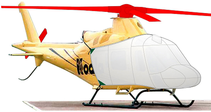
Koala Bubble, Rotor Hub, Blade & Tail Rotor Covers (illustration)