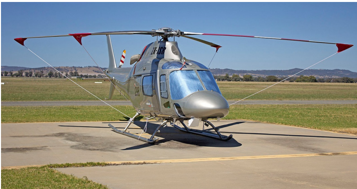
Agusta 119 Cockpit/Cabin HeatShields

Cabin Heatshields are interior sunshades for the aircraft's passenger cabin area. The product is a unique composite of closed-cell foam with a silver mylar finish. The semi-rigid design is stiff enough to stand inside the window framing. The set folds up flat and is easily stored in the included storage sleeve. Some designs may require velcro and suction cups. A Heatshield is an excellent short-term remedy for cockpit overheating, but an external fabric cover is more effective for long-term protection.