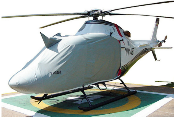
Koala Bubble Cover (with Wire Strike)

Travel Covers are made with Silver Solution-Dyed Polyester fabric and fully lined over the entire cover. The material is lightweight and more compact for easy storage in the aircraft. The polyester material is water resistant, but only intended for occasional use outside. We also have an ultra lightweight material available for fitted hangar dust covers. For daily outdoor use, the non-travel Sunbrella Cover is the best choice.