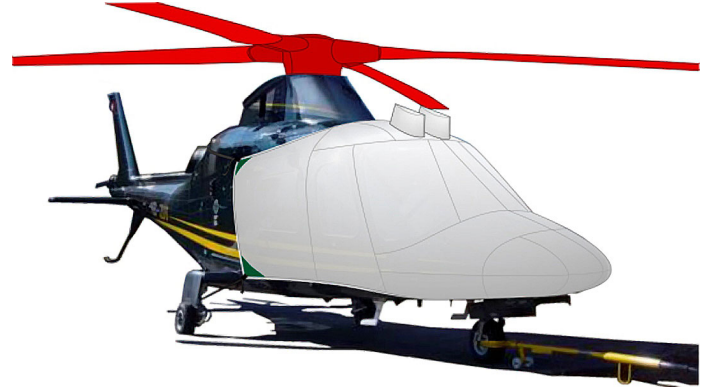
Agusta 109 Bubble, Rotor Hub & Blade Covers (illustration)