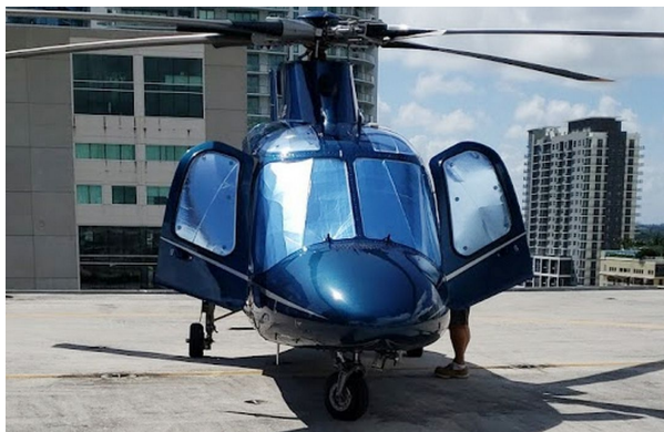
Agusta AW109 Power, A109E Heatshield Set