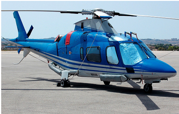
Agusta Power Cockpit HeatShields & Blade Tie-downs

WINTER USE MATERIAL - Made with Solution-Dyed Polyester fabric, this option is intended for seasonal use to aid in deicing, rain mitigation, or for occasional travel. The material is lighter and more compact, but more susceptible to UV damage and may have a shorter useful life if used continuously outside than the all-year use material.