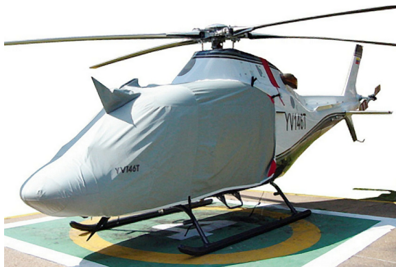
Koala Bubble Cover (with Wire Strike)

Travel Covers are made with Silver Solution-Dyed Polyester fabric and fully lined over the entire cover. The material is lightweight and more compact for easy stowage in the aircraft. The polyester material is water resistant, but only intended for occasional use outside. We also have an ultra lightweight material available for fitted hangar dust covers. For daily outdoor use, the non-travel Sunbrella Cover is the best choice.