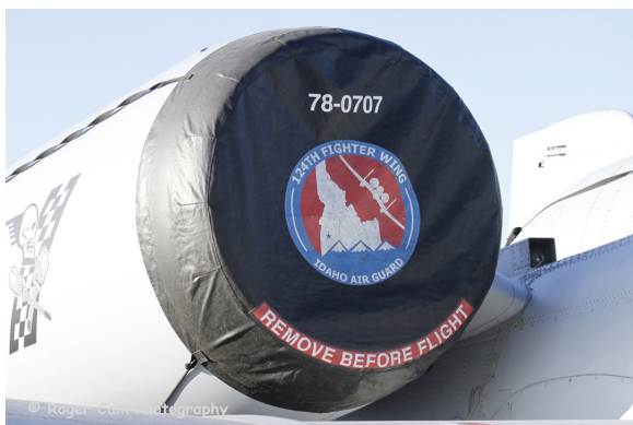
Fairchild A-10 Engine Covers

ALL-YEAR USE MATERIAL - Made with Solution dyed Polyester fabric, the all-year use material is the best option for sun protection and cover longevity. This heavier more durable material is intended for all weather conditions, such as rain and snow or lots of sun.