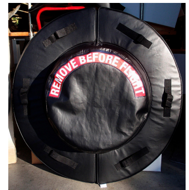
A-10 Exhaust Plug/Cover