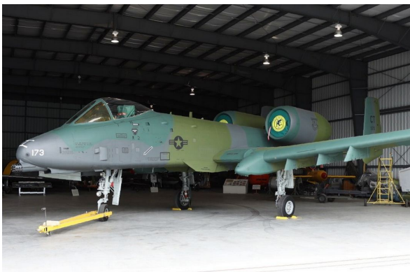
Fairchild A10 Intake Plugs, non-folding type

The Engine Inlet Plugs are custom fit for your Fairchild A10 Thunderbolt intakes, made with heavy-duty vinyl material, and stuffed with a single block of sculpted urethane foam. Each plug has a zipper that allows the foam to be removed and dried if necessary. Engine plugs have 'remove before flight' streamers sewn onto the face of the plugs. Most plugs are imprinted with the aircraft registration number in black for an extra charge. Storage bag NOT included. Engine plugs may be inserted after flight when the engine is still warm. Engine Inlet Plugs are commonly referred to as Cowl Plugs, Intake Plugs, Cowl Blocks, Engine Blocks, and Engine Bungs.