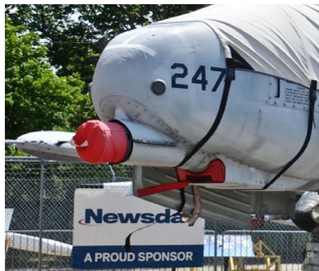
Fairchild A10 Thunderbolt Nose Gun Cover, Gun Scoop Inlet Plug

The Engine Inlet Plugs are custom fit for your Fairchild A10 Thunderbolt intakes, made with heavy-duty vinyl material, and stuffed with a single block of sculpted urethane foam. Each plug has a zipper that allows the foam to be removed and dried if necessary. Engine plugs have 'remove before flight' streamers sewn onto the face of the plugs. Most plugs are imprinted with the aircraft registration number in black for an extra charge. Storage bag NOT included. Engine plugs may be inserted after flight when the engine is still warm. Engine Inlet Plugs are commonly referred to as Cowl Plugs, Intake Plugs, Cowl Blocks, Engine Blocks, and Engine Bungs.