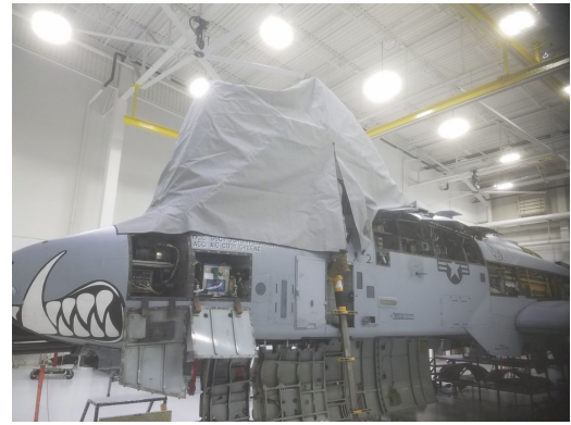
Fairchild A-10 Canopy Cover, open position