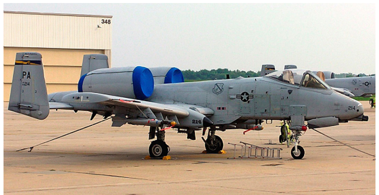
A-10 Engine Covers