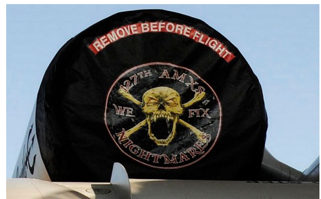
A-10 Engine Covers with Custom Artwork