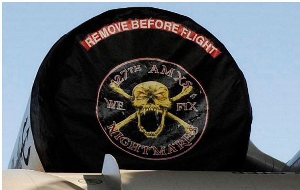
A-10 Engine Covers with Custom Artwork

ALL-YEAR USE MATERIAL - Made with Solution dyed Polyester fabric, the all-year use material is the best option for sun protection and cover longevity. This heavier more durable material is intended for all weather conditions, such as rain and snow or lots of sun.