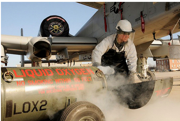
A-10 Engine Intake Cover

ALL-YEAR USE MATERIAL - Made with Solution dyed Polyester fabric, the all-year use material is the best option for sun protection and cover longevity. This heavier more durable material is intended for all weather conditions, such as rain and snow or lots of sun.