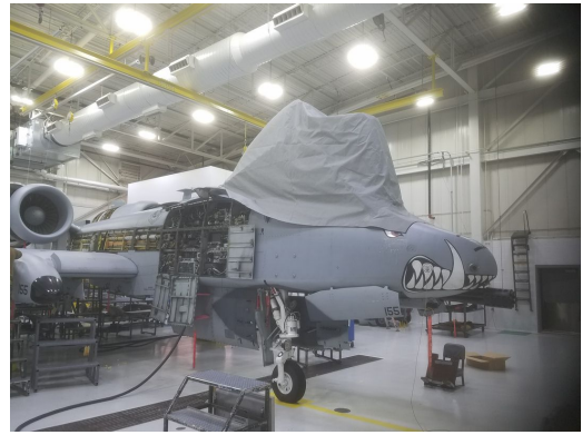
Fairchild A-10 Canopy Cover, open position