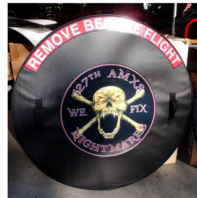
A-10 Engine Intake Plug