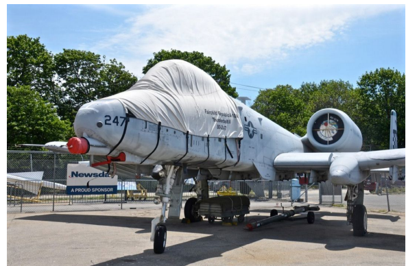
Fairchild A10 Thunderbolt Nose Gun Cover, Gun Scoop Inlet Plug Fairchild A10 Thunderbolt Canopy Cover, Nose Gun Cover, Gun Scoop Inlet Plug