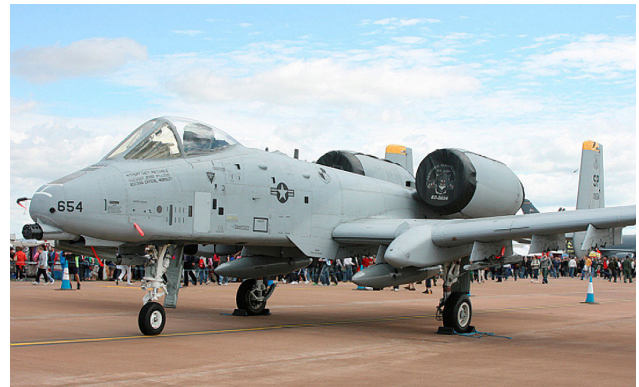
A-10 Engine Covers with Custom Artwork