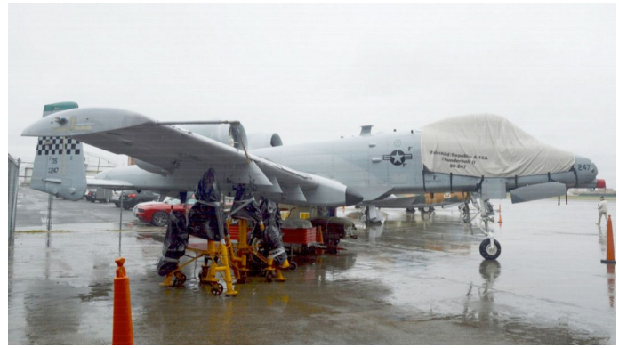
Fairchild A10 Thunderbolt Canopy Cover