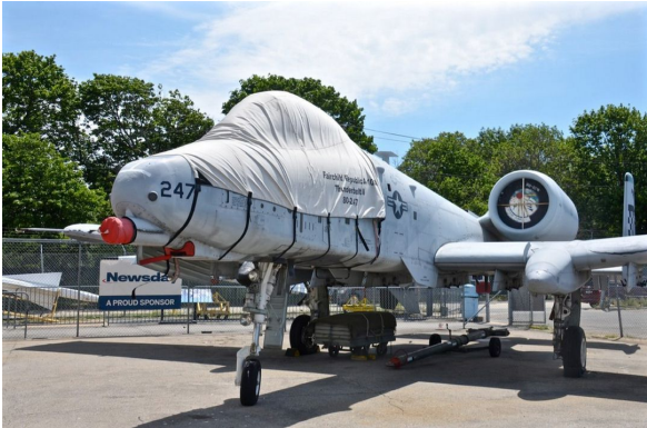
Fairchild A10 Thunderbolt Nose Gun Cover, Gun Scoop Inlet Plug Fairchild A10 Thunderbolt Canopy Cover, Nose Gun Cover, Gun Scoop Inlet Plug