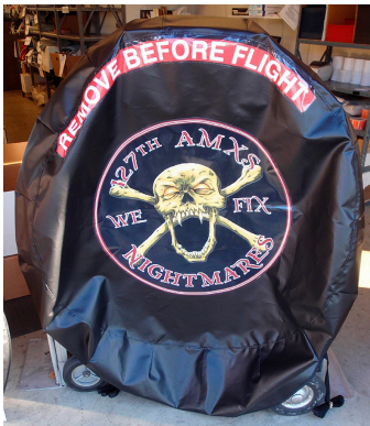
A-10 Engine Intake Cover

ALL-YEAR USE MATERIAL - Made with Solution dyed Polyester fabric, the all-year use material is the best option for sun protection and cover longevity. This heavier more durable material is intended for all weather conditions, such as rain and snow or lots of sun.