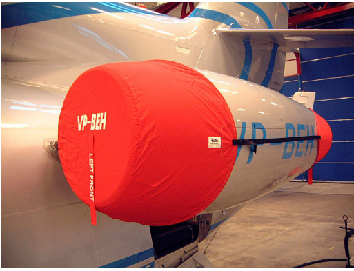
Falcon 900 Engine Covers, outboard & inboard strap detail