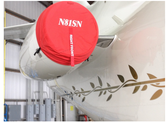
Falcon 900EX Intake Cover