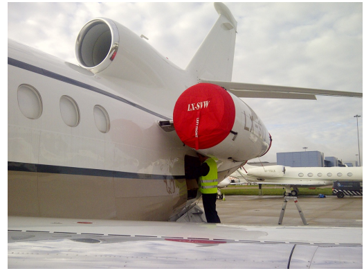
Falcon 900EX Engine Covers