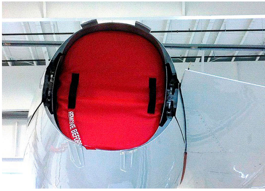
Falcon 2000EX Exhaust Plug