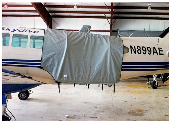
750XL Jump Door Cover