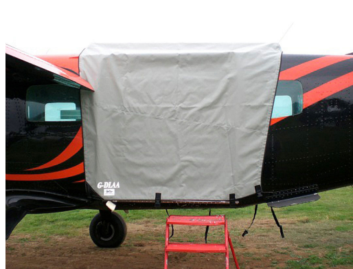
Cessna 208 Caravan Jump Door Cover