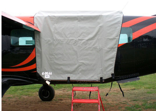
Cessna 208 Caravan Jump Door Cover