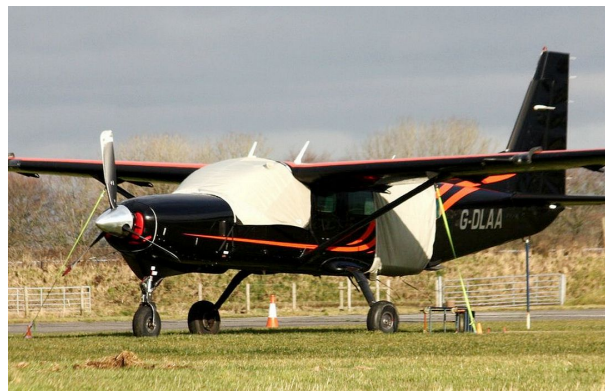
Cessna Caravan Cockpit Cover, Engine Plugs, Jump Door Cover