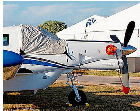
750XL Cockpit Cover & Prop Tie/Exhaust Covers