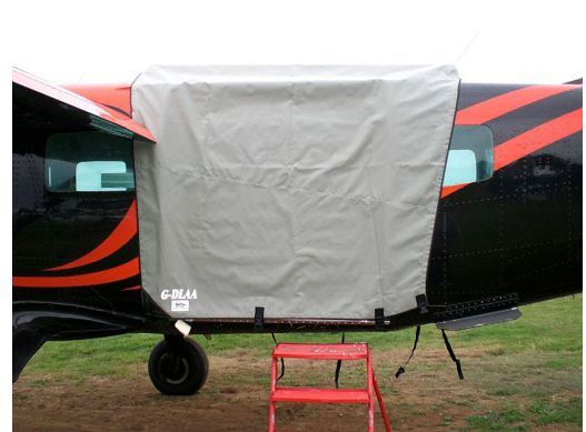
Cessna 208 Caravan Jump Door Cover