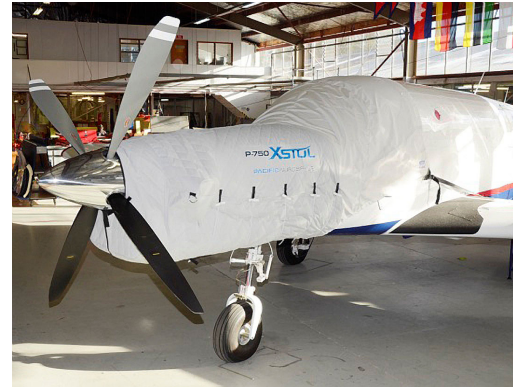
750XL Combination Insulated Engine Cover/Cockpit Cover