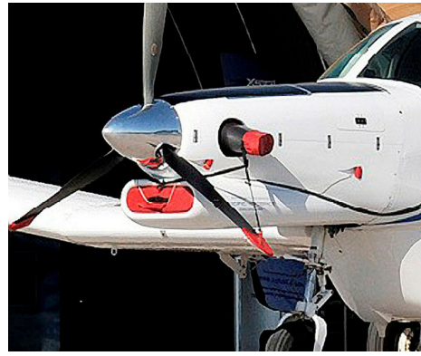
750XL Engine Inlet Plugs & Prop Tie/Exhaust Covers