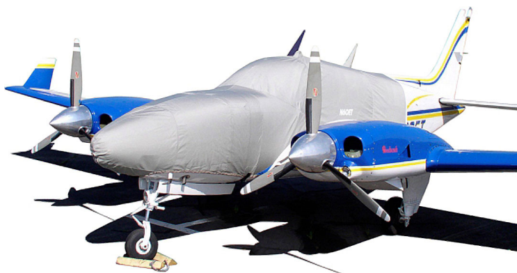
Baron Canopy/Nose Cover

Travel Covers are made with Silver Solution-Dyed Polyester fabric and only lined over the windshield to save weight. The material is lightweight and more compact for easy stowage in the aircraft. The polyester material is water resistant, but only intended for occasional use outside. We also have an ultra lightweight material available for fitted hangar dust covers. For daily outdoor use, the non-travel Sunbrella Cover is the best choice.