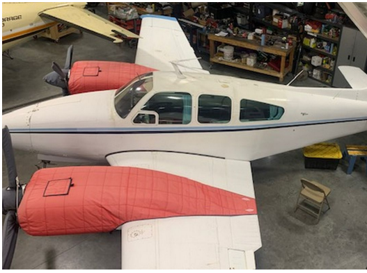
Beech Baron B55 Insulated Engine Covers