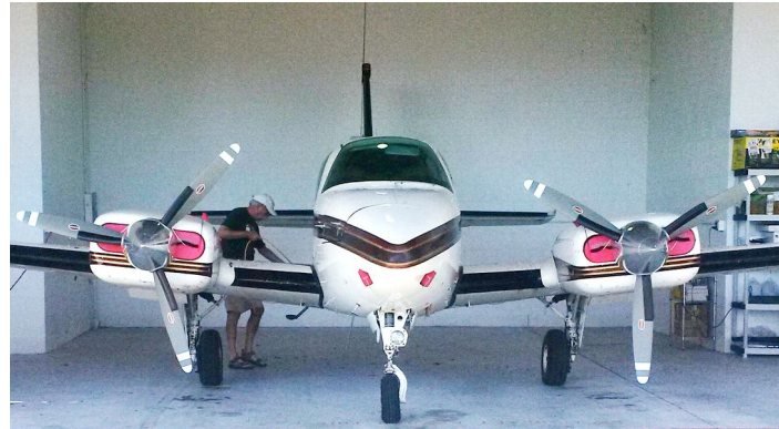
Beech Baron 58 Engine Inlet Plugs, Heater Inlet Plugs