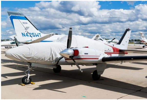
Beech Baron D55 Canopy/Nose Cover