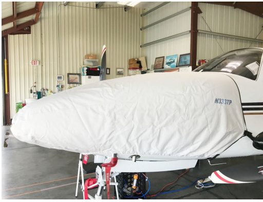
Beech Baron G58 Nose Cover