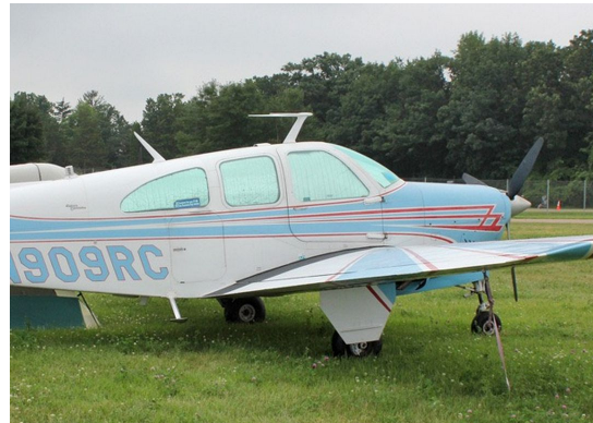
Beech Bonanza/Debonair HeatShield Set