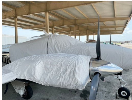
Beech Baron 58P Extended Canopy/Nose Cover, Wing/Engine Covers (test fit)