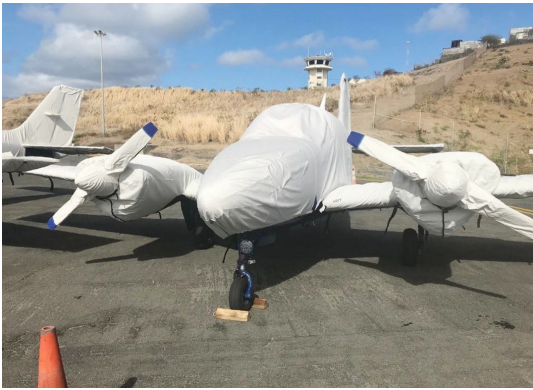
Beech Travel Air Full Cover Set

WINTER USE MATERIAL - Made with Solution-Dyed Polyester fabric, this option is intended for seasonal use to aid in deicing, rain mitigation, or for occasional travel. The material is lighter and more compact, but more susceptible to UV damage and may have a shorter useful life if used continuously outside than the all-year use material.