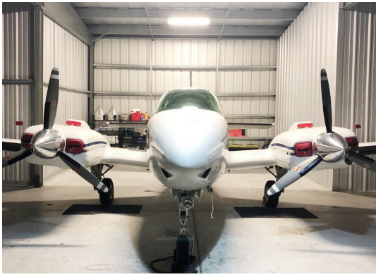
Beech Baron Engine Plugs