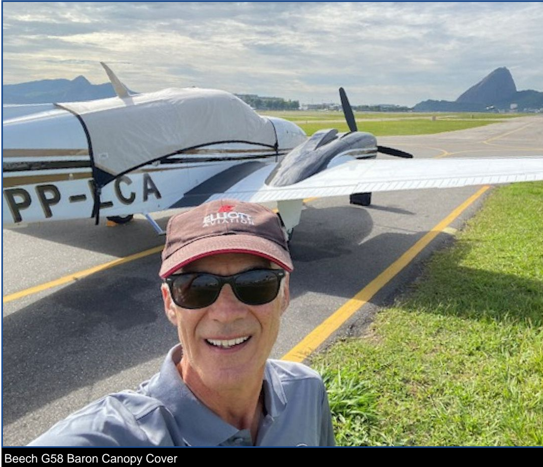
Beech G58 Baron Canopy Cover