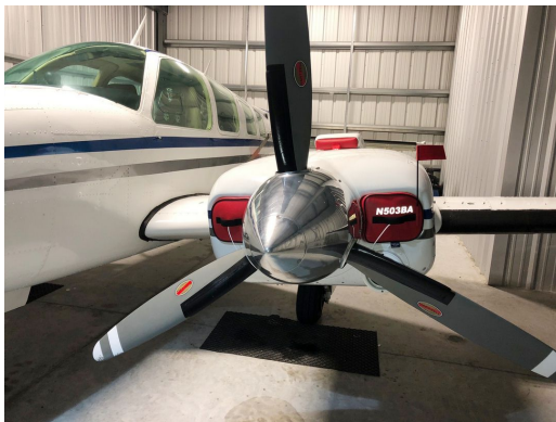
Beech Baron Engine Plugs

Engine Inlet Plugs are custom fit for your Beech Baron 58P intakes, made with heavy-duty vinyl material, and stuffed with a single block of sculpted urethane foam. Each plug has a zipper that allows the foam to be removed and dried if necessary. Engine plugs have warning flags that are visible from the cockpit or 'remove before flight' streamers sewn onto the face of the plugs. Most plugs are imprinted with the aircraft registration number in black for an extra charge. Storage bag NOT included. Engine plugs may be inserted after flight when the engine is still warm. Engine Inlet Plugs are commonly referred to as Cowl Plugs, Intake Plugs, Cowl Blocks, Engine Blocks, and Engine Bungs.