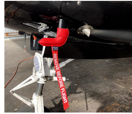
Baron 58 Pitot Cover