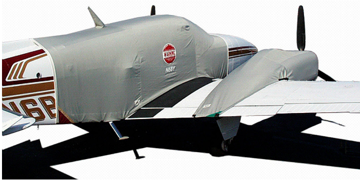
Baron Extended Canopy Cover & Engine Covers