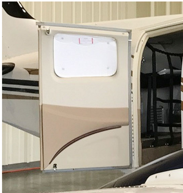
Beech Baron 58 Cabin HeatShield

Heatshields are interior sunshades for an aircraft's windows or canopy glass. The product is a unique composite of closed-cell foam with a silver mylar finish. The semi-rigid design is stiff enough to stand along the inside of the windshield using sun visors or window framing. It folds up flat and easily stores in the included storage sleeve. Some designs may require velcro and suction cups. A Heatshield is an excellent short-term remedy for cockpit overheating.