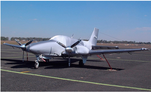
Baron FULL COVER SET, Light Weight Travel &/or Fitted Dust Cover Set