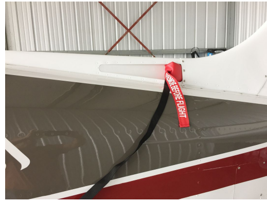
Beech Bonanza/Baron Fresh Air Intake & Exhaust Plugs