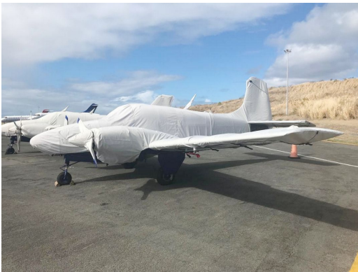
Beech Travel Air Full Cover Set

WINTER USE MATERIAL - Made with Solution-Dyed Polyester fabric, this option is intended for seasonal use to aid in deicing, rain mitigation, or for occasional travel. The material is lighter and more compact, but more susceptible to UV damage and may have a shorter useful life if used continuously outside than the all-year use material.