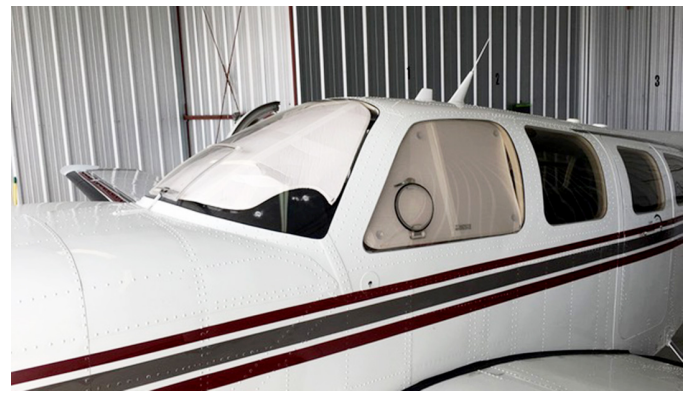
Beech Baron 58P Cockpit Heatshield Set