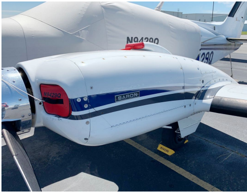
Beech Baron 58 Engine Plugs