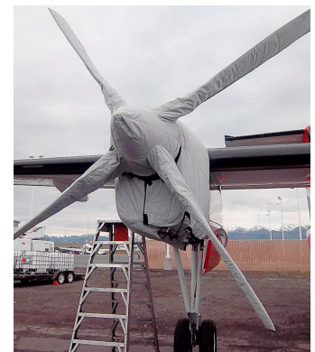
Dash 8 Insulated Engine & Prop Covers