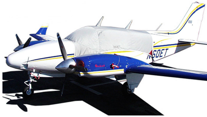
Standard Canopy Cover & Engine Plugs