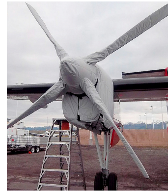
Dash 8 Insulated Engine & Prop Covers