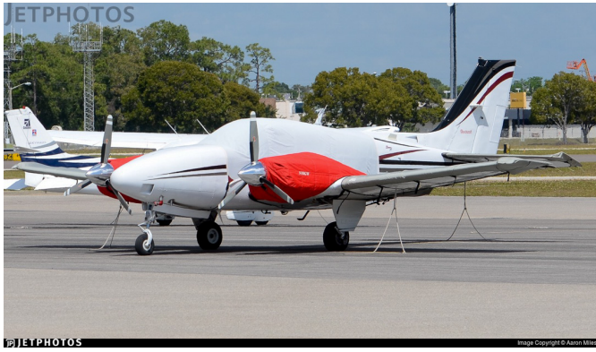
Beech Baron 58, G58 Canopy Cover, Insulated Engine Covers