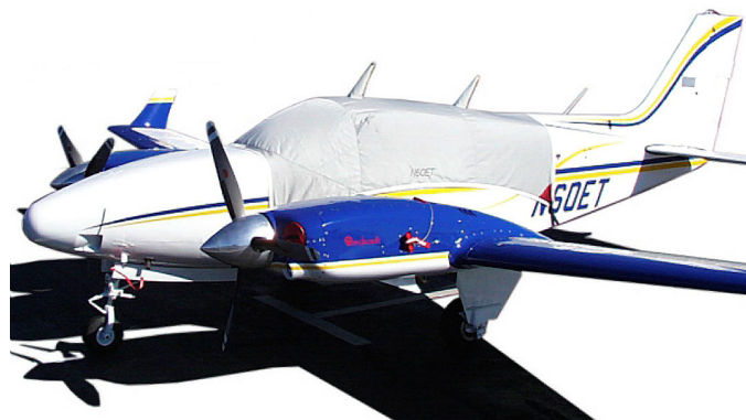
Standard Canopy Cover & Engine Plugs

Travel Covers are made with Silver Solution-Dyed Polyester fabric and only lined over the windshield to save weight. The material is lightweight and more compact for easy stowage in the aircraft. The polyester material is water resistant, but only intended for occasional use outside. We also have an ultra lightweight material available for fitted hangar dust covers. For daily outdoor use, the non-travel Sunbrella Cover is the best choice.