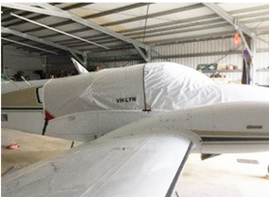
Beech Baron B-55 Canopy Cover

This cover type is made from Silver Acrylic Sunbrella canvas and is 100% lined with a soft and smooth microfiber. Bruce's Custom Covers developed this material combination especially for aircraft protection. The outer material is medium weight and treated for water resistance, UV resistance and anti-static buildup. The inner lining is a very soft and smooth microfiber to prevent scratching. The material is very reflective, and tests show that the cabin interior temperature can be reduced to near-ambient temperature on the hottest of days. It is water, ice and snow repellent, yet breathable to allow moisture to escape from between the cover and the aircraft surface.