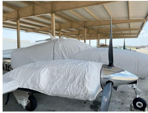
Beech Baron 58P Extended Canopy/Nose Cover, Wing/Engine Covers (test fit)