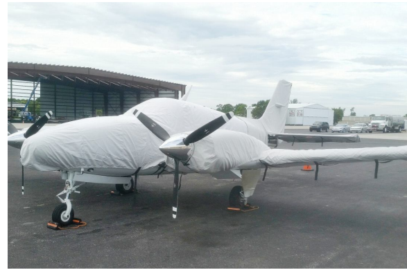
Full Cover Set (58P-020, 58P-225, 58P-405)