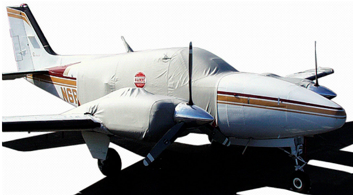
Standard Canopy Cover & Engine Plugs. Extended Canopy Cover & Engine Cover

This cover type is made from Silver Acrylic Sunbrella canvas and is 100% lined with a soft and smooth microfiber. Bruce's Custom Covers developed this material combination especially for aircraft protection. The outer material is medium weight and treated for water resistance, UV resistance and anti-static buildup. The inner lining is a very soft and smooth microfiber to prevent scratching. The material is very reflective, and tests show that the cabin interior temperature can be reduced to near-ambient temperature on the hottest of days. It is water, ice and snow repellent, yet breathable to allow moisture to escape from between the cover and the aircraft surface.