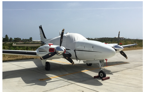
Baron 58 Canopy Cover, Engine Plugs