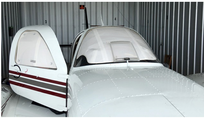
Beech Baron 58P Cockpit Heatshield Set