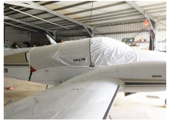
Beech Baron B-55 Canopy Cover