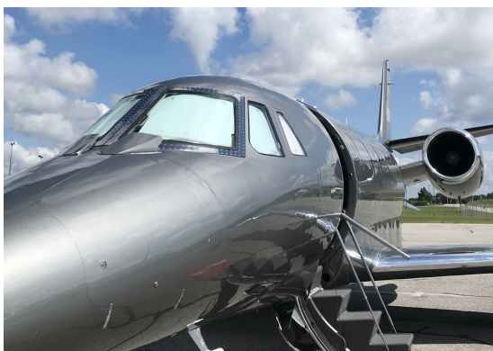
Cessna Citation 560XL Cockpit HeatShields

Custom-made Heatshield Sunshades are available for almost any window in the jet. Side windows, Skylights, and Emergency Exits are all custom-made. The product is a unique composite of closed-cell foam with a silver mylar finish. The set is easily stored in the included storage sleeve. Some designs may require velcro and suction cups. Our Heatshields are offered white side out since aircraft manufacturers have issued advisories against reflective window inserts due to potential heat damage.