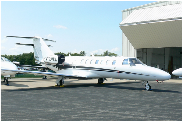
Cessna Citation CJ3 Bikini Style Engine Covers

The Cessna Citationjet V Encore (560) Intake/Exhaust Plugs are custom fit for the intake and exhaust openings, made with heavy-duty vinyl material, and stuffed with a single block of sculpted urethane foam. Each plug has a zipper that allows the foam to be removed and dried if necessary. Engine plugs have 'remove before flight' streamers sewn onto the face of the plugs. Most plugs are imprinted with the aircraft registration number in black. Engine plugs may be inserted after flight when the engine is still warm. Engine Inlet Plugs are commonly referred to as Cowl Plugs, Intake Plugs, Cowl Blocks, Engine Blocks, and Engine Bungs.