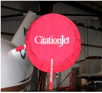
Cessna Citation Engine Cover Set