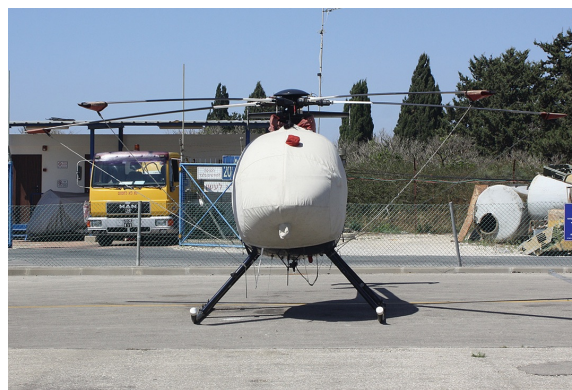
MD-500E Bubble Cover, Blade Tie-Diwns