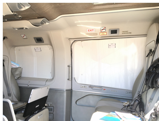
Eurocopter EC-145 Cabin Heatshields