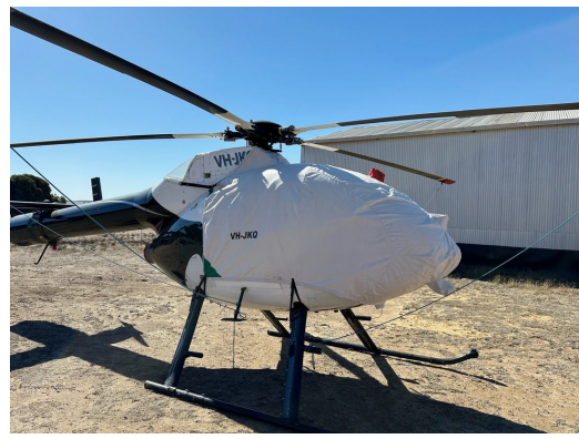
MDD 520 NOTAR Bubble Cover w/Intake Cover Add-On