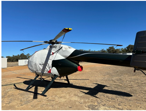
MDD 520 NOTAR Bubble Cover w/Intake Cover Add-On, Exhaust Cover