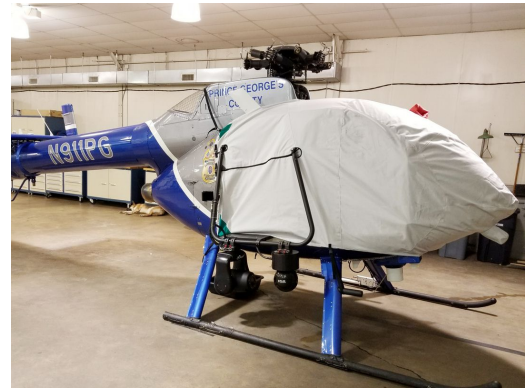
McDonnell Douglas MDD 520 Notar Bubble Cover, with special missions equipment.