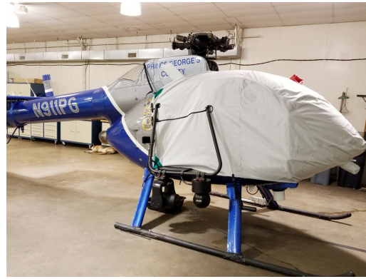
McDonnell Douglas MDD 520 Notar Bubble Cover, with special missions equipment.