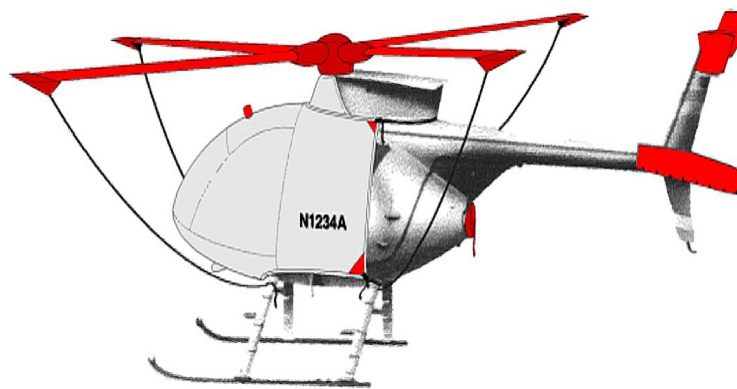
Full Cover Set

The Tailboom Cover details vary by model, but generally the helicopter tail boom cover encloses the tail boom from the "bottleneck" to the aft end. They usually also cover the horizontal stabilizers, and are custom made to allow for antennae, lights, and other protrusions. They attach with straps underneath the tail boom. Covers for the vertical and horizontal stabilizers are also available separately. Specific information for each model is available on request.