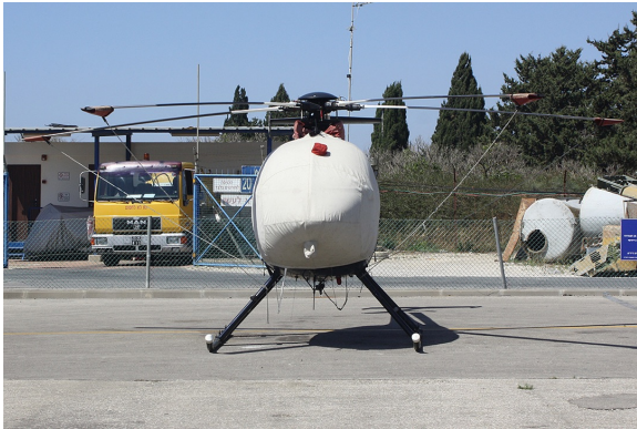
MD-500E Bubble Cover, Blade Tie-Downs