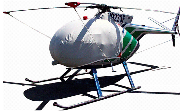
Hughes 500C Bubble Cover with Intake Add-on, Blade Tie-downs