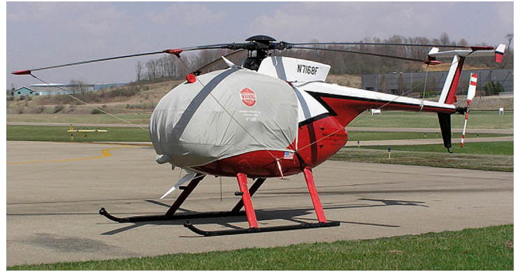
Hughes 500D Bubble Cover with Wire Strike detail and Blade Tie-downs