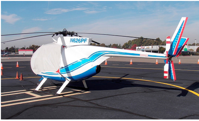
MD500C Bubble Cover with Wire Strike detail