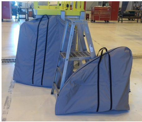
Eurocopter EC-145 Padded Bags for Removable Doors

**Padded Door Bags* are designed to provide portable protection of the doors when they are removed from the aircraft. They are padded to moderate thickness, zippered closed, and have sturdy carry handles for easy transport.