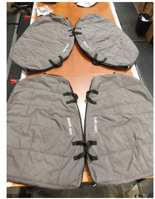
MD 500D Padded Door Bags