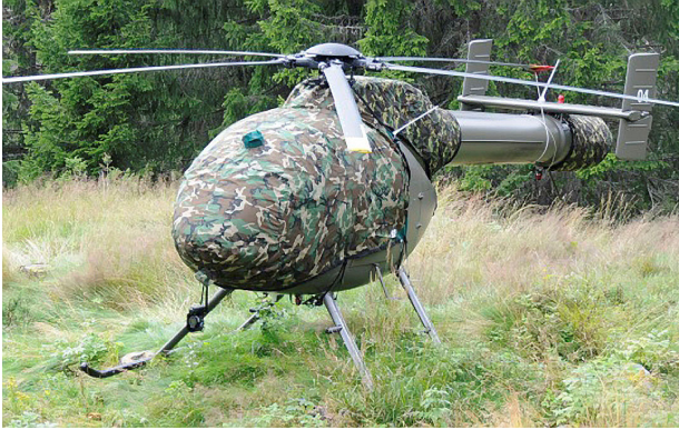
MD520 NOTAR Bubble, Engine, & NOTAR Covers & Blade Tie-downs

Travel Covers are made with Silver Solution-Dyed Polyester fabric and fully lined over the entire cover. The material is lightweight and more compact for easy stowage in the aircraft. The polyester material is water resistant, but only intended for occasional use outside. We also have an ultra lightweight material available for fitted hangar dust covers. For daily outdoor use, the non-travel Sunbrella Cover is the best choice.