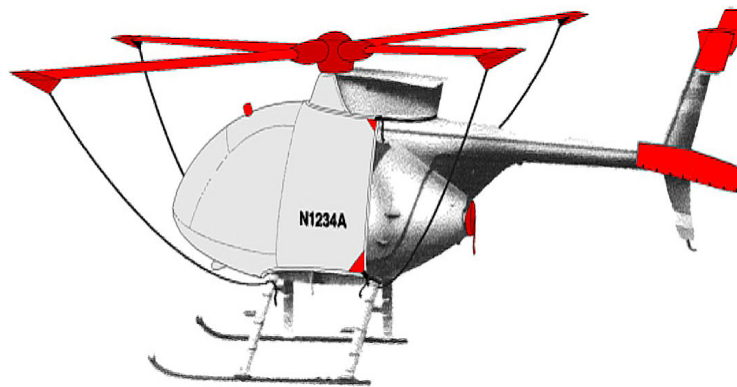
Full Cover Set

The Tailboom Cover details vary by model, but generally the helicopter tail boom cover encloses the tail boom from the "bottleneck" to the aft end. They usually also cover the horizontal stabilizers, and are custom made to allow for antennae, lights, and other protrusions. They attach with straps underneath the tail boom. Covers for the vertical and horizontal stabilizers are also available separately. Specific information for each model is available on request.