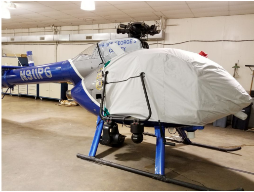
McDonnell Douglas MDD 520 Notar Bubble Cover, with special missions equipment.

Travel Covers are made with Silver Solution-Dyed Polyester fabric and fully lined over the entire cover. The material is lightweight and more compact for easy storage in the aircraft. The polyester material is water resistant, but only intended for occasional use outside. We also have an ultra lightweight material available for fitted hangar dust covers. For daily outdoor use, the non-travel Sunbrella Cover is the best choice.