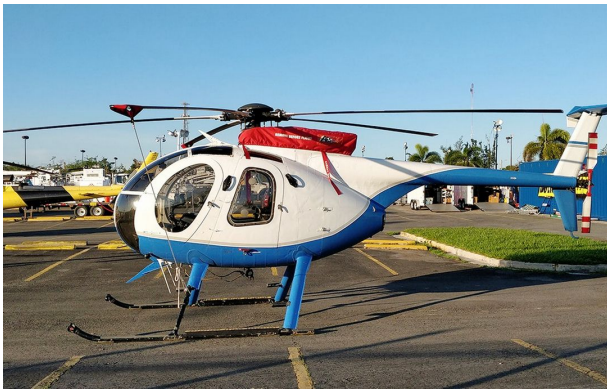
Hughes 500D Blade Tie-Downs, Doghouse Cover

WINTER USE MATERIAL - Made with Solution-Dyed Polyester fabric, this option is intended for seasonal use to aid in deicing, rain mitigation, or for occasional travel. The material is lighter and more compact, but more susceptible to UV damage and may have a shorter useful life if used continuously outside than the all-year use material.