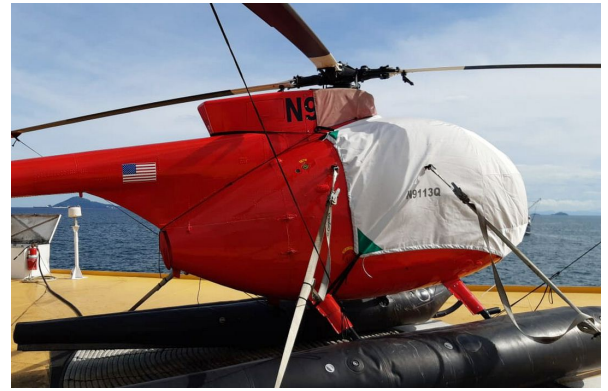
Hughes 500C (369HS) Bubble Cover