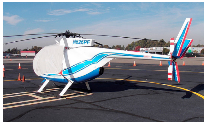
MD500C Bubble Cover with Wire Strike detail