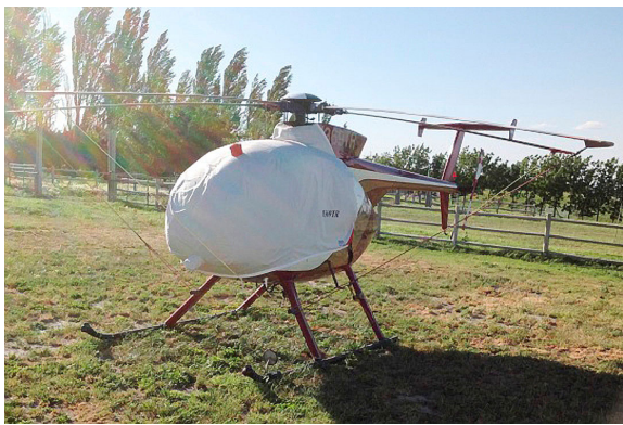
MD500D Bubble Cover with Intake Add-On