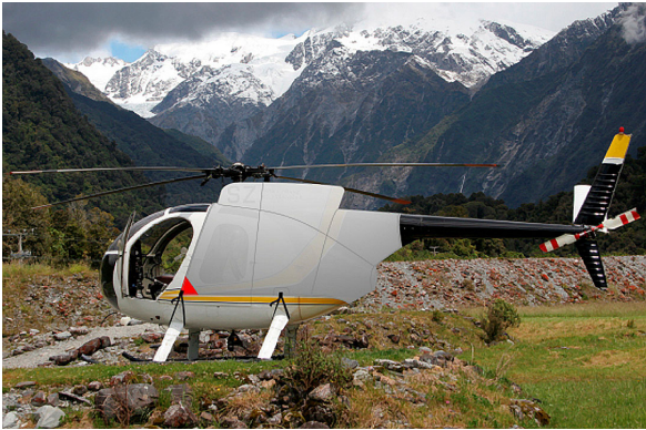
Engine Cover (illustration)