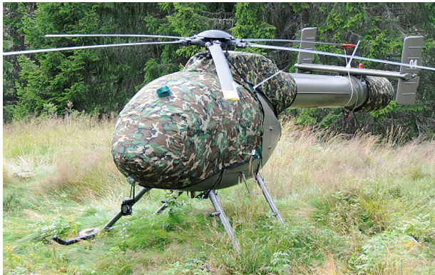
MD520 NOTAR Bubble, Engine, & NOTAR Covers & Blade Tie-downs

Travel Covers are made with Silver Solution-Dyed Polyester fabric and fully lined over the entire cover. The material is lightweight and more compact for easy stowage in the aircraft. The polyester material is water resistant, but only intended for occasional use outside. We also have an ultra lightweight material available for fitted hangar dust covers. For daily outdoor use, the non-travel Sunbrella Cover is the best choice.