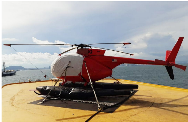
Hughes 500C (369HS) Bubble Cover, Blade Tie-Downs

WINTER USE MATERIAL - Made with Solution-Dyed Polyester fabric, this option is intended for seasonal use to aid in deicing, rain mitigation, or for occasional travel. The material is lighter and more compact, but more susceptible to UV damage and may have a shorter useful life if used continuously outside than the all-year use material.