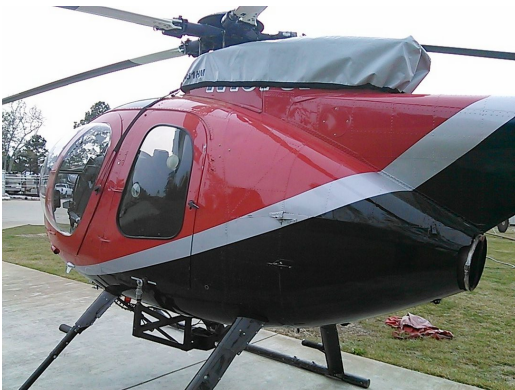
Customized Engine Cover

WINTER USE MATERIAL - Made with Solution-Dyed Polyester fabric, this option is intended for seasonal use to aid in deicing, rain mitigation, or for occasional travel. The material is lighter and more compact, but more susceptible to UV damage and may have a shorter useful life if used continuously outside than the all-year use material.