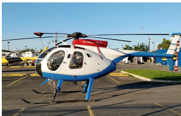
Hughes 500D Blade Tie-Downs, Doghouse Cover