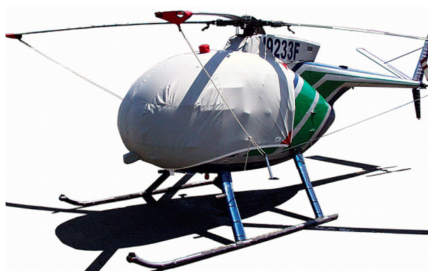
Hughes 500C Bubble Cover with Intake Add-on, Blade Tie-downs