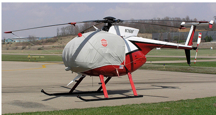
Hughes 500D Bubble Cover with Wire Strike detail and Blade Tie-downs

Travel Covers are made with Silver Solution-Dyed Polyester fabric and fully lined over the entire cover. The material is lightweight and more compact for easy stowage in the aircraft. The polyester material is water resistant, but only intended for occasional use outside. We also have an ultra lightweight material available for fitted hangar dust covers. For daily outdoor use, the non-travel Sunbrella Cover is the best choice.