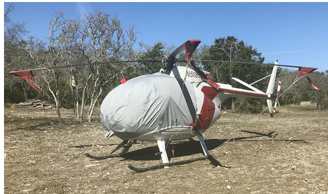
Hughes 500C, OH-6A Bubble Cover