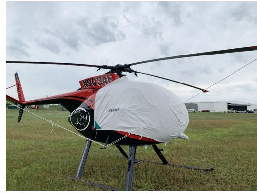
Hughes 500C Bubble Cover with Intake Add-On